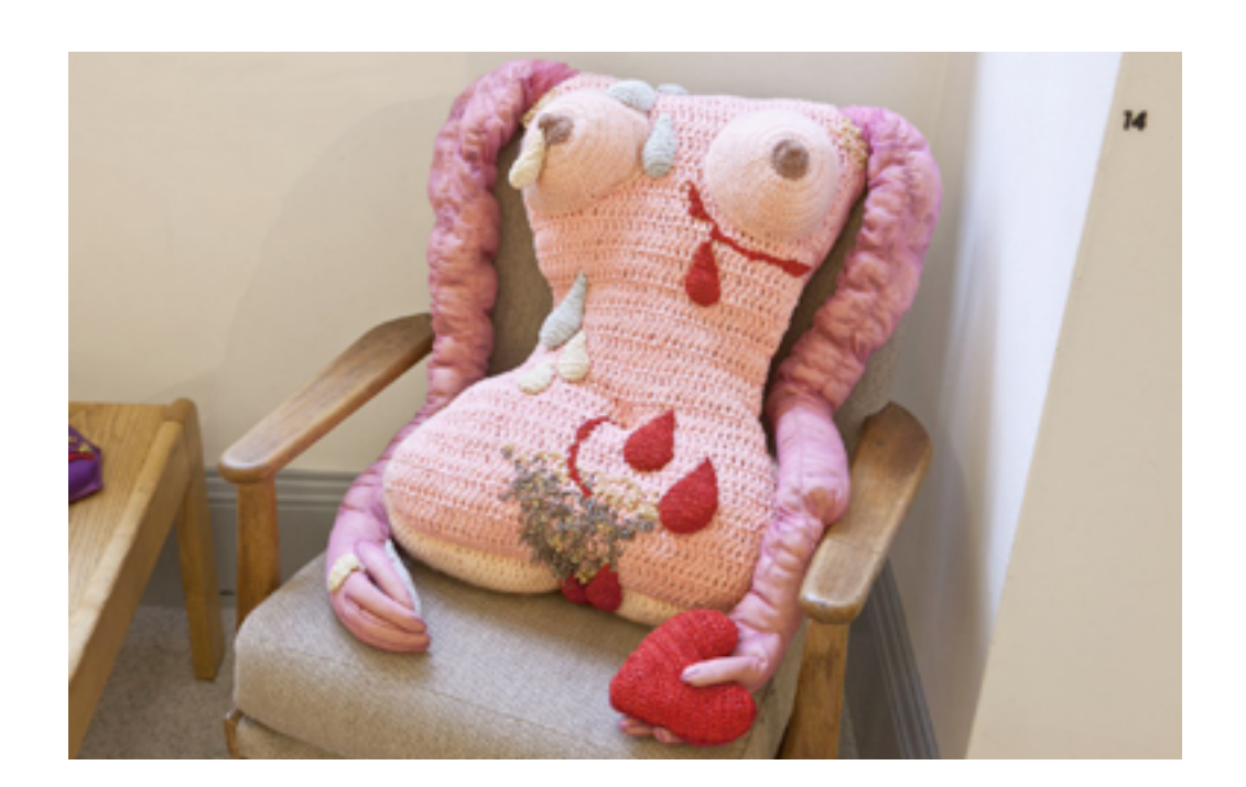
FIGURE No 3

Su Richardson, Virgin/Mother/Whore , 1983. Crocheted wool, fabric, found objects. Installation shot.