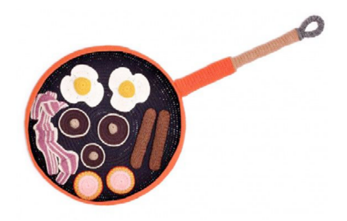
FIGURE No 5

Kate Jenkins, Le Crochet Frying Pan , 2009. Crocheted wool mounted on A1 board, 59.5cm x 84cm. Courtesy of the artist, http://www.cardigan.ltd.uk/kate-jenkins.php