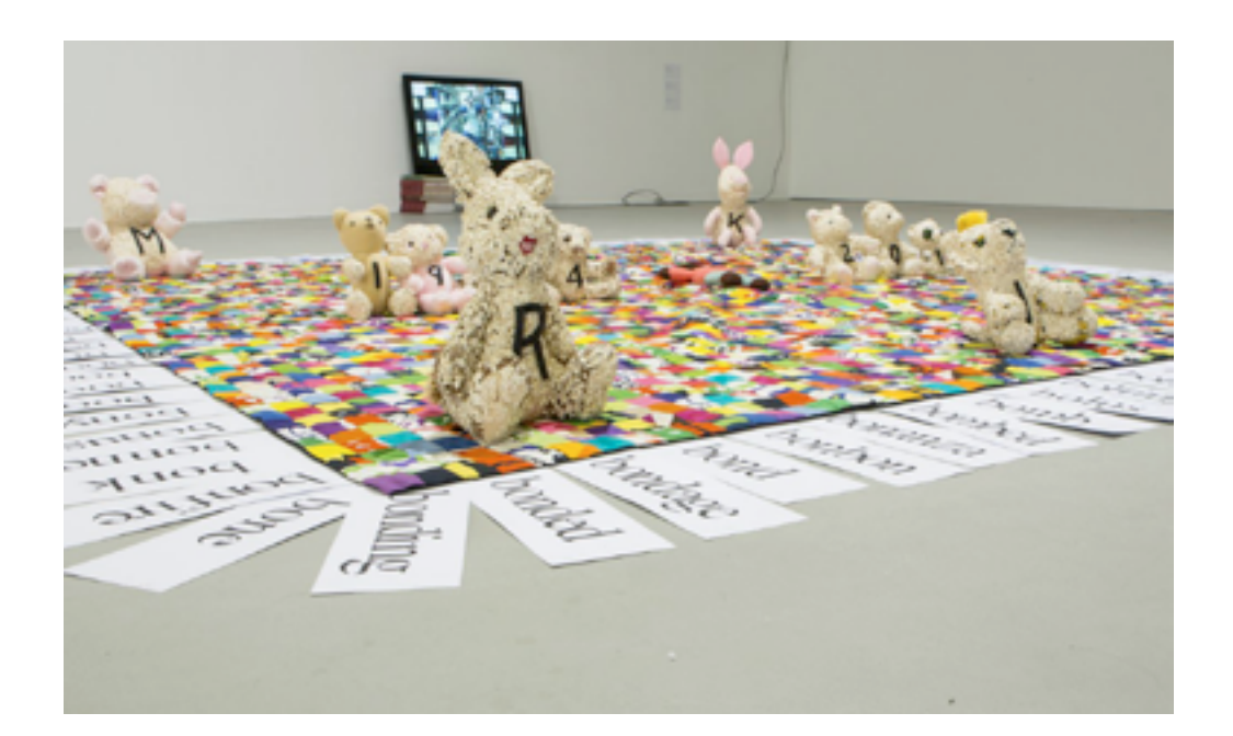
FIGURE No 7