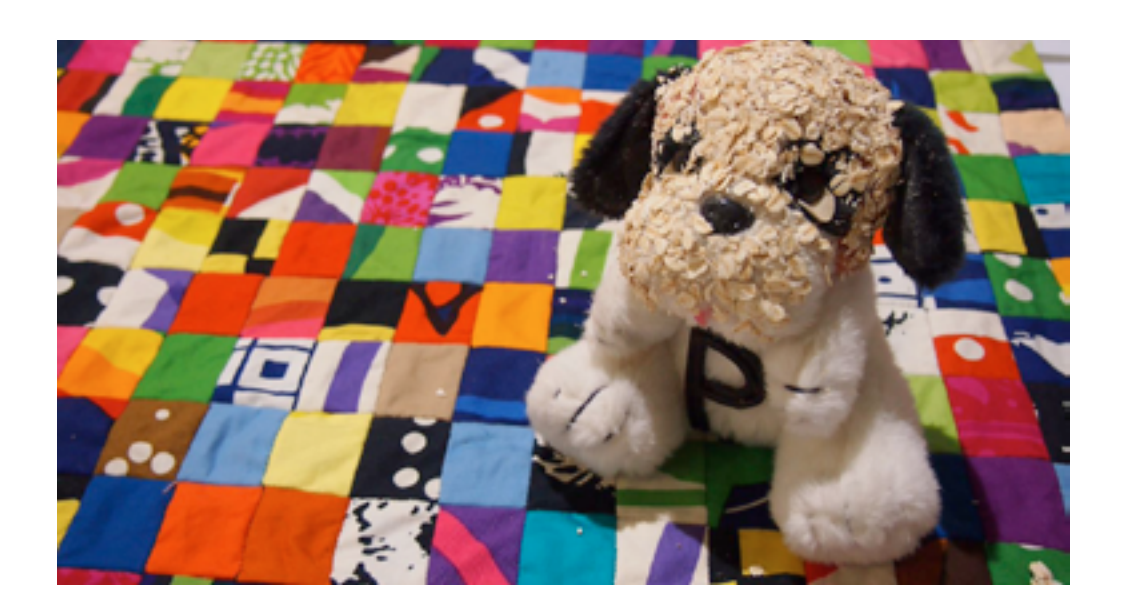
FIGURE No 9

Bronwyn Platten, For more and more love hours (R.I.P. Mike Kelley 1954-2012), 1973-2013, detail.