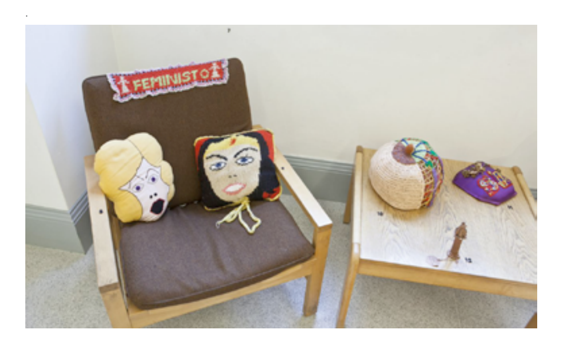
FIGURE Nº 4

Su Richardson, Virgin/Mother/Whore , 1983. Crocheted wool, fabric, found objects. Installation shot. Courtesy of the artist and the Goldsmiths Textile Collection. Photograph by David Ramkalawon.