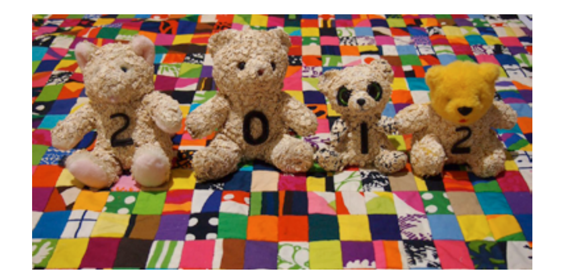
FIGURE Nº 8

Bronwyn Platten, For more and more love hours (R.I.P. Mike Kelley 1954-2012), 1973-2013, detail. Courtesy of the artist. Photograph by Alison Main.