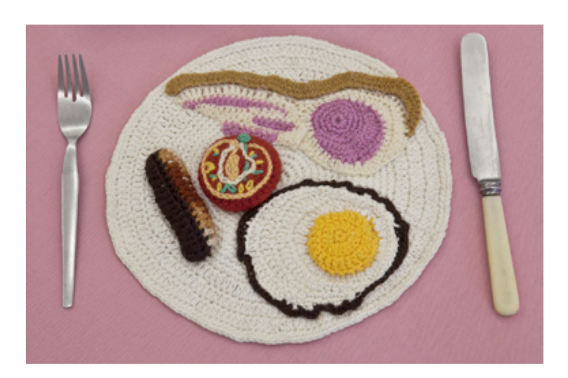
FIGURE Nº 1

Su Richardson, Burnt Breakfast, 1976. Crocheted wool, found objects. Dimensions variable.