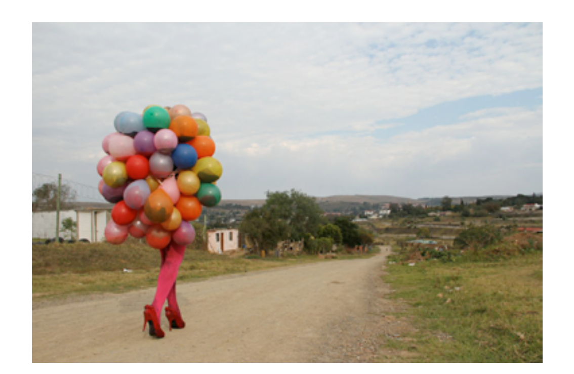
FIGURE Nº 1

As part of his Performa Obscura performance at the National Arts Festival in 2012, Athi-Patra Ruga traversed Grahamstown in his distinctive balloon outfit that would come to define his White Women of Azania character.