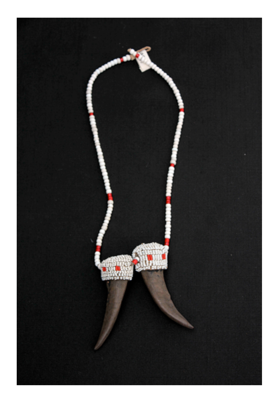
FIGURE No 4

Unknown artist, "Zulu" beaded duiker necklace, nineteenth century. Accession no: 2010.14.03.077. Wits Art Galleries Collection.