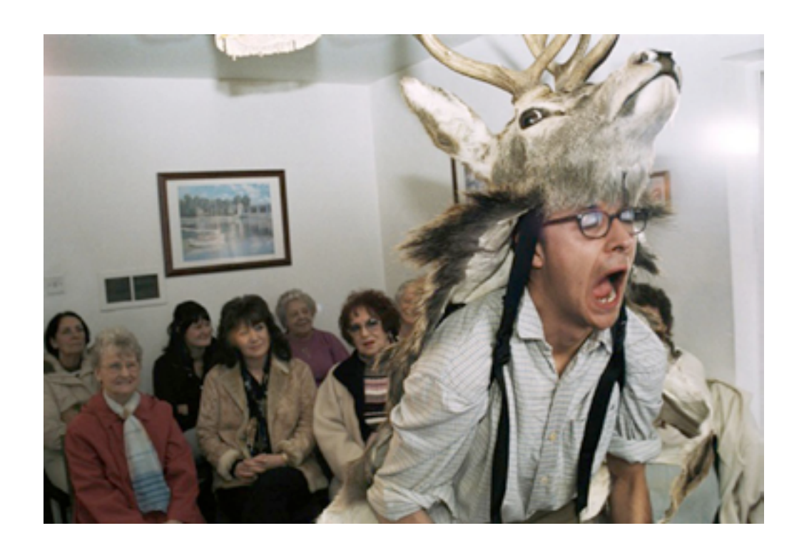
FIGURE No 7

Jurgen Meekel, Sleeping Beauty , 2012. Screen-grab form the motion graphic digital video. 3 minutes.