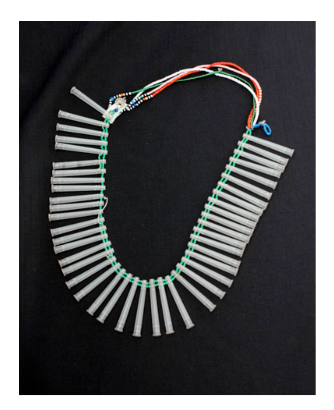
FIGURE N^{o} 5