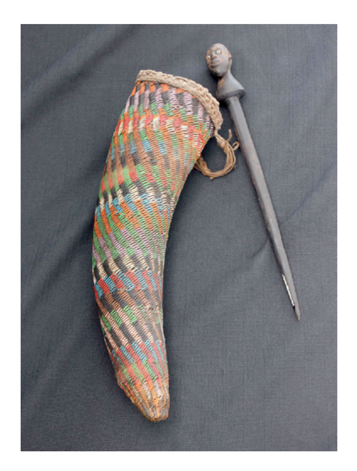
figure N^0 3

Unknown artist, "Tsonga" medicine horn with telephone wire detail, twentieth century. Accession no: 2006.10.05.03/09. Wits Art Galleries Collection.