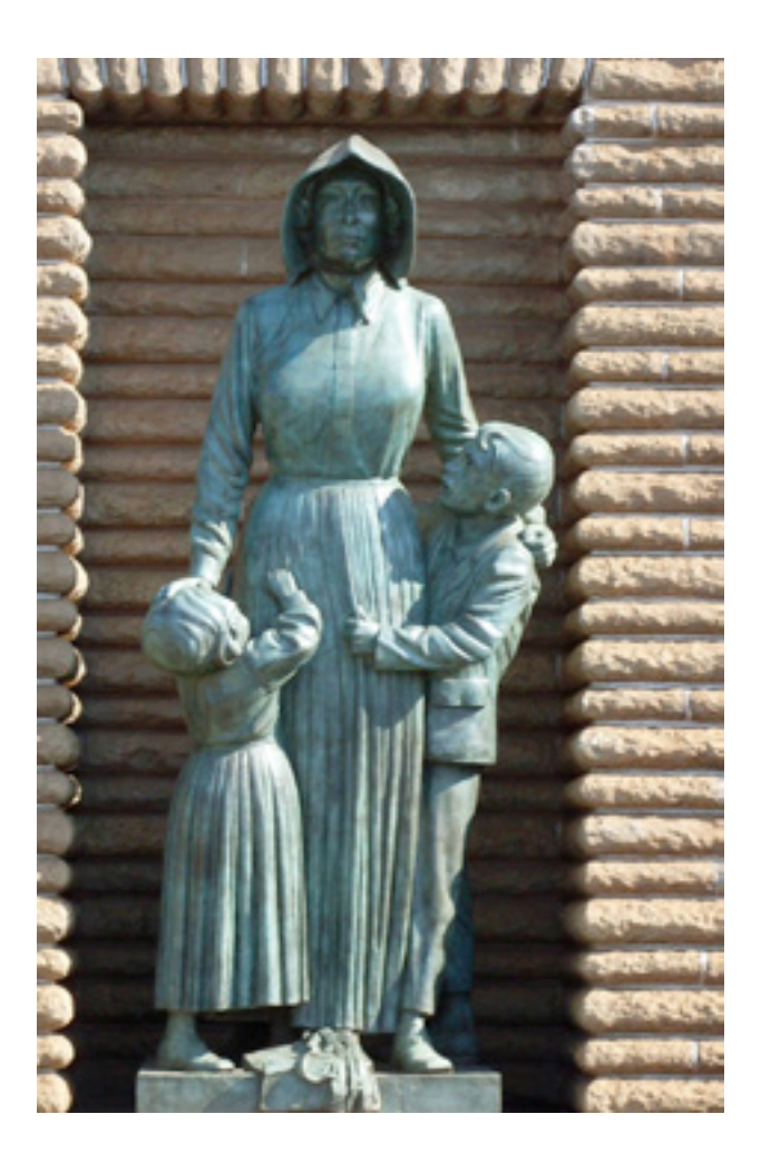
Figure 5: Anton van Wouw, Voortrekker woman with children , 1949. Voortrekker Monument, Pretoria (Paulsen 2012).