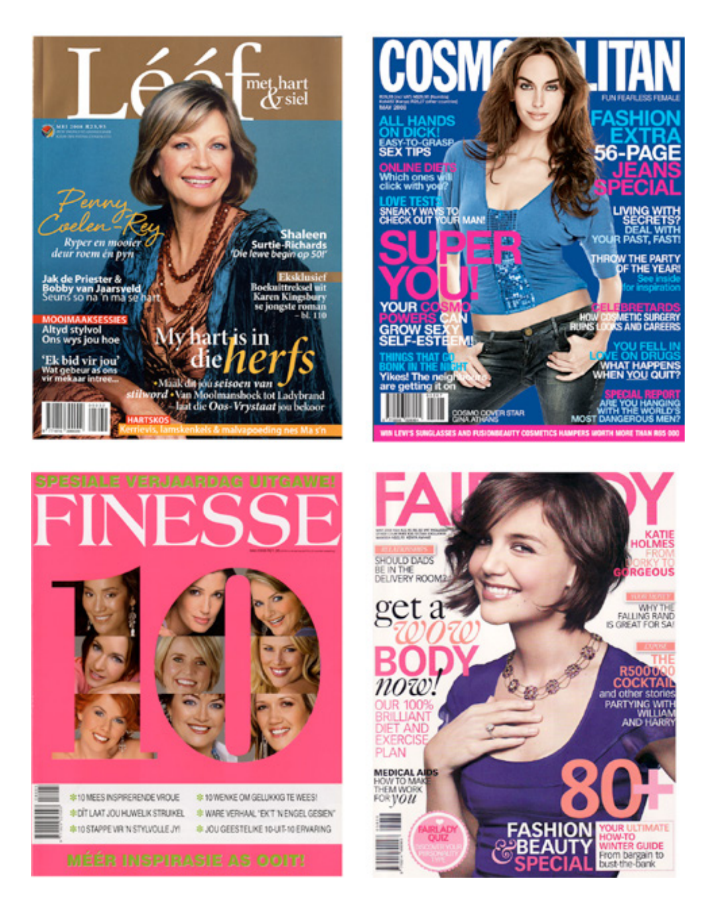
Figure 3: Front covers of Lééf (2008); Cosmopolitan (Oosthuizen 2011); Finesse (2008); and Fair Lady (Larney 2011).