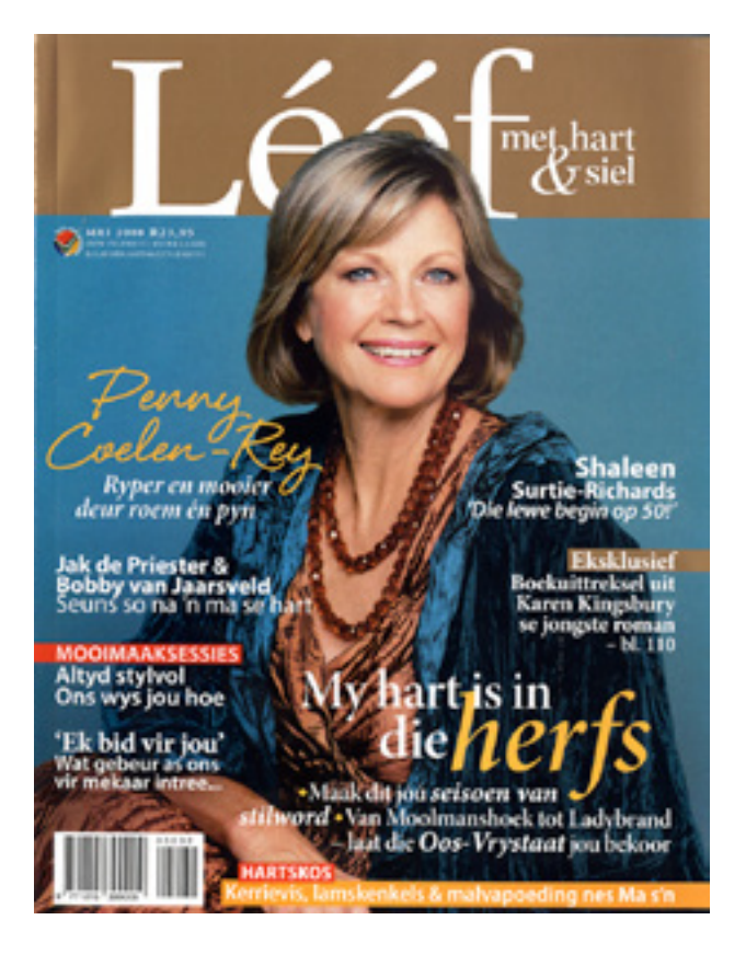
Figure 2: Front cover of Lééf (May 2008).

Similarly, the text on the Lééf cover (Figure 2) constructs a particular version of Christian-Afrikaans femininity by including the words 'boys', 'mother', 'stylish', 'pray' and 'heart-food' ( Lééf 2008). These words immediately imply that, in a nutshell, an ideal Christian-Afrikaans woman is a deeply religious, stylish mother who shares her love by cooking. Once again, these characteristics overlap with the biblical feminine ideal as set out by Geldenhuys (1954) and Joubert and Smith (2010) and fix the gender identity of the ideal reader in the realm of the domestic sphere.