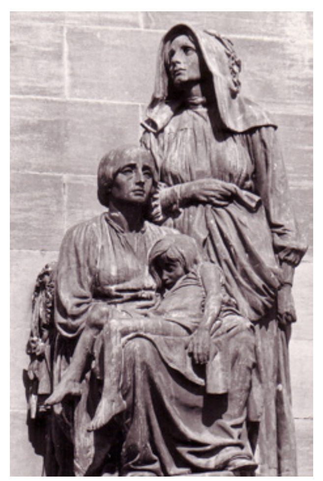
Figure 6: Anton van Wouw, National Women's Monument , 1913. National Women's Monument, Bloemfontein (Labuschagne 2012).

More specifically, Liese van der Watt (2009:93) identifies a 'volksmoeder discourse' evident in the Voortrekker Tapestry (created between 1952 and 1960) which depicts scenes from the Great Trek of 1838. On display at the Voortrekker Monument in Pretoria, the depictions of the women in the fifteen tapestry panels form, according to Van der Watt (2009:93), part of a larger nationalist project aimed at 'venerating' and 'exalting' the mothers of the Afrikaner nation. Always portrayed within the domestic realm, women are depicted in well-defined and structured familial relationships which create and reinforce the 'overt harmony' (Van der Watt 2009:96) of the Voortrekker family. At the same time, the gendering of space in the tapestries 'offered an important way in which traditional patriarchal hierarchies within the Voortrekker, and by extension the Afrikaner family, could be reinforced' (Van der Watt 2009:97).<sup>11</sup>