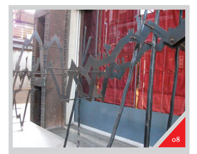
Figure 8: Cianfanelli's gold index.

But the little figures on Urban Being don't put up much of a fight. It takes a leisured spectator to notice them, quite unlike the human figures Cianfanelli has made dramatising their moments of anguish, joy and workaday life along the index of the gold price that stands in the foyer of Anglo-Gold Ashanti's Turbine Hall in Johannesburg (Figure 8). The overall impression of Urban Being is of overwhelming solidity, lack of flexibility and a ponderous dependence on the spectator to allow for his multi-dimensionality to become evident. It is as if Urban Being is immobilised by his setting. One is tempted to conclude, probably unjustly, that Being might be able to take the same kind of assertive stride forward as Fire Walker if he were standing somewhere in Johannesburg instead of in a suburban shopping centre in Pretoria which is, according to Mabin's (2011) portrayal, still waiting after all these years to