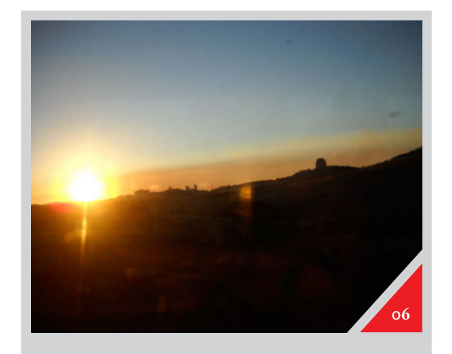
Figure 6: Drive by Voortrekker Monument.

It is useful, at this point, to return to Carrier's typology of the monument genre (see above), which attempts to perform various symbolic functions in terms of summoning a community and of persuading it to unite around recognisable 'historical traditions'. Cianfanelli maintains that it is important to incorporate what a review of his work calls 'an emissary from the past' in making 'place' speak to the 'intellectual and emotional desires for location'. These are envisaged as the starting point for the 'construction of self' followed by the much more elaborate constructions of 'community' and 'nation' (Dodd 2011b). I would argue that Cianfanelli (and other authors of Freedom Park), as well as understanding the need to compete with the aesthetic impact of the Voortrekker Monument, recognises the need to match its historical credentials - the powerful narrative it encapsulates of a pioneering people who forged ahead against incredible adversity to achieve nationhood. The quandary is how to cater to desires that are so dis-located and dispersed that they need a literal reembodiment of the past to persuade them that they belong together. His brief is not essentially different from that of the Voortrekker Monument's designers confronted with divided 'Afrikanerdom' in the early twentieth century, but it is probably a good deal more