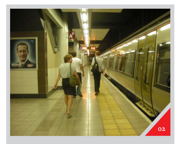
Figure 2: Gautrain.

In the sections of the paper in which I discuss public art I ask, drawing on the work of de Certeau et al , what