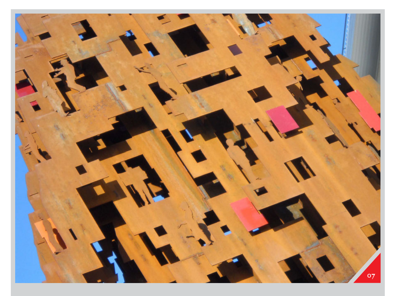
Figure 7: Small People and Sky, detail from Urban Being.

But the little figures on Urban Being don't put up much of a fight. It takes a leisured spectator to notice them, quite unlike the human figures Cianfanelli has made dramatising their moments of anguish, joy and workaday life along the index of the gold price that stands in the foyer of Anglo-Gold Ashanti's Turbine Hall in Johannesburg (Figure 8). The overall impression of Urban Being is of overwhelming solidity, lack of flexibility and a ponderous dependence on the spectator to allow for his multi-dimensionality to become evident. It is as if Urban Being is immobilised by his setting. One is tempted to conclude, probably unjustly, that Being might be able to take the same kind of assertive stride forward as Fire Walker if he were standing somewhere in Johannesburg instead of in a suburban shopping centre in Pretoria which is, according to Mabin's (2011) portrayal, still waiting after all these years to