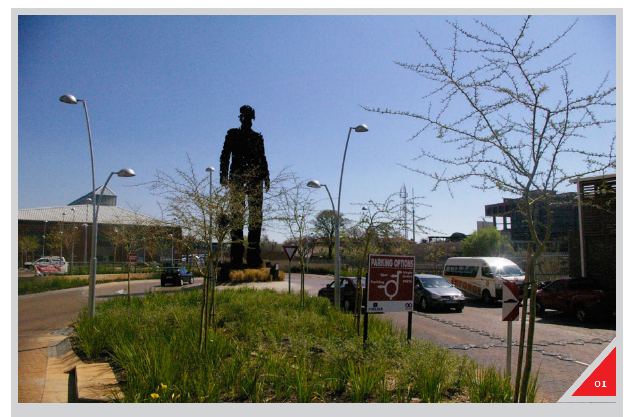
Figure 1: M Cianfanelli, Urban Being on traffic island.

responsible for the new memorial structure at Freedom Park have caused me to interrogate what may well be a new monumentalism.