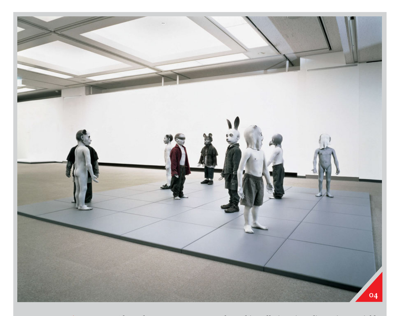
Figure 4: Jane Alexander, Bom Boys, 2002, sculptural installation view, dimensions variable. Courtesy of the artist and Tobu Museum.

of alienation and ambiguity. Greenberg (2003) states that, 'the Bom Boys ... exist in a nowhere land, they are simultaneously victims and aggressors and evoke multiple responses of pity, curiosity, fear, shame, pathos, guilt, anxiety, and sympathy'. This empathetic response has much to do with the animal attributes of these figures, associated in human narratives with innocence. It does not escape Greenberg (2003) however, that every day many South Africans pass similar subjects on street corners, unimpassioned and even a little irritated by the inconvenience and latent threat of their demanding presence. The animal features that take the form of masks accompanying these child-like figures contribute to this impression of threat and criminal intent. This is owing to the criminal associations of