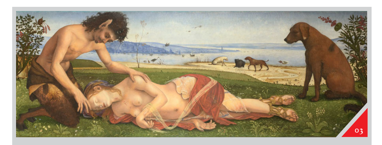
Figure 3: Piero di Cosimo, The Death of Procis (A Satyr Mourning over a Nymph), c.1500, oil on canvas, 65 x 183 cm.

layer of meaning, and indeed the one most pertinent to my argument, is the concept of autobiography. The Death of Procris was created by a man who Giorgio Vasari (cited by Clark 1977:176) reported to be 'less [of] a man than a beast'. The faun in this image, who kneels attentively at the side of the fallen Procis, has been linked with Correggio's play where the faun covets Procris and ill advises her against her husband, and in so doing, brings about her undoing (Hagen 2001:185). A further compelling and biographical reading is to link this therianthropic creature with the mythic and animalistic reputation of the artist and the punctum: man cloaked in beast. This figure's faun legs constitute a metonym for the larger notion of animality. Yet the apparent peeling off of the faun's animal skin (visible at the waist), and the anthropomorphic tenderness of his gesture, tell another story: man and not beast. This is a humanist sentiment typical of the era of its creation, where human beings saw nature as a pleasant setting for their lives (Hagen 2001:185), and as a foil for the depiction of human character.