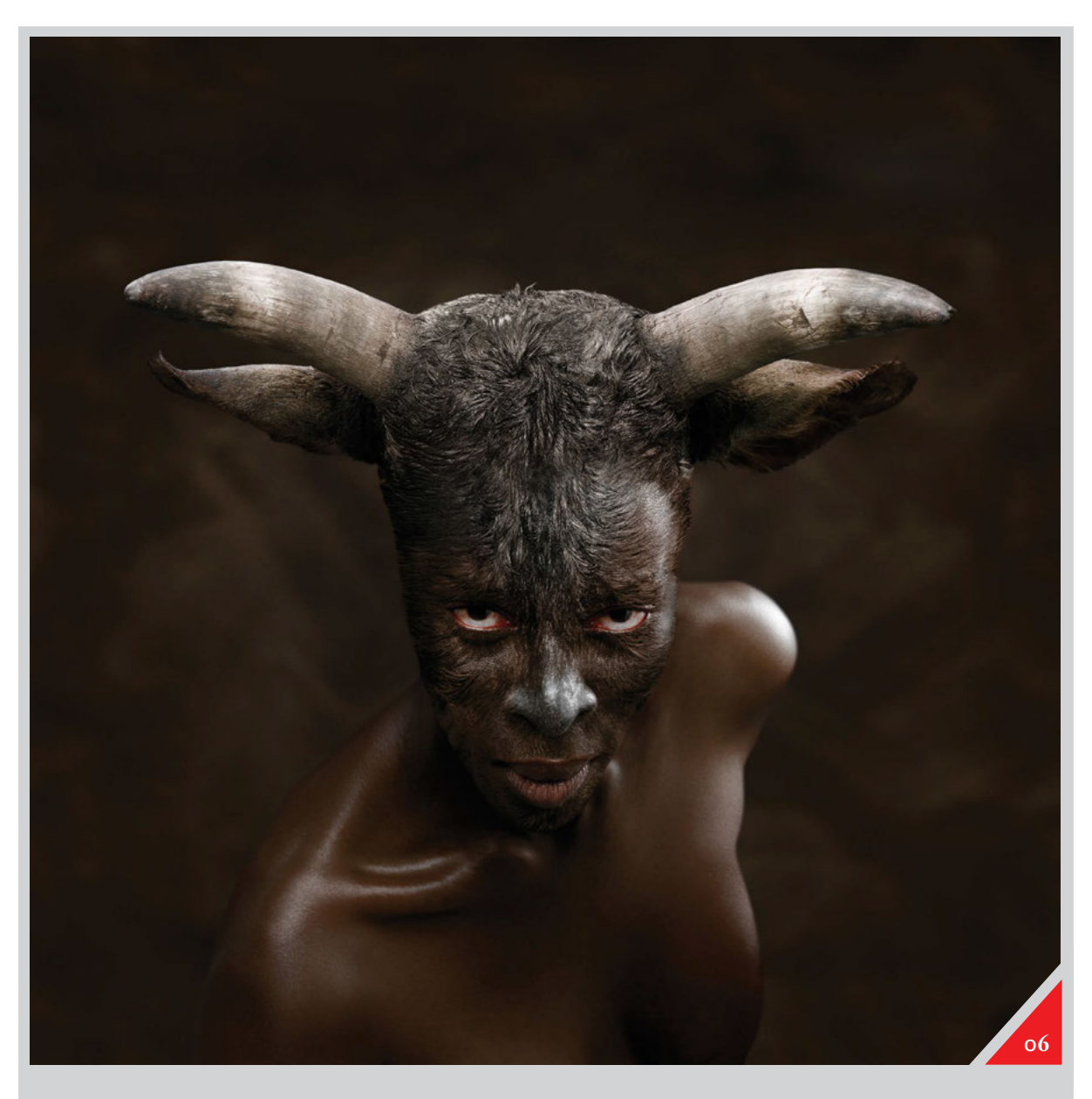
Figure 6: Nandipha Mntambo, Europa, 2008, archival ink on cotton rag paper, 100 x 100 cm.

In a strikingly mythological register, the South African artist Nandipha Mntambo enacts a therianthropic metamorphoses. The resulting work entitled Europa