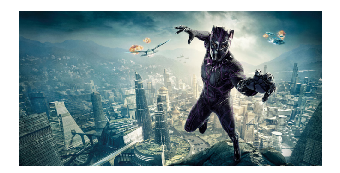
FIGURE N^{0} 5