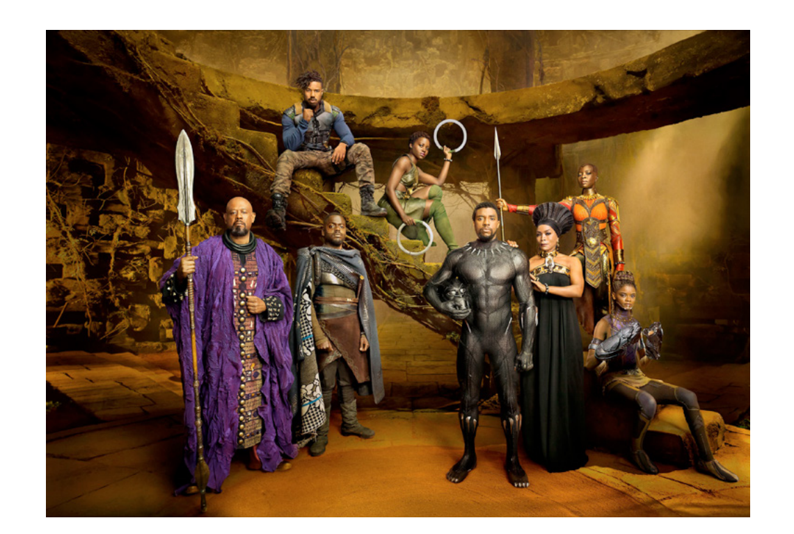
FIGURE No 2

Black Panther costumes Marvel Entertainment (moviestillsdb 2018; cf. Coogler 2018) ©MARVEL (fair use copyright permission).