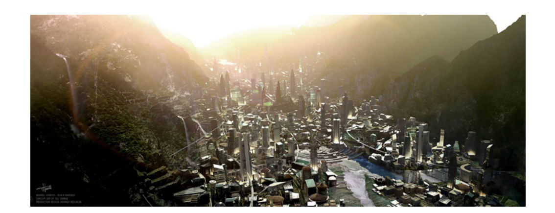
FIGURE No 6

Black Panther Aerial of city sunset Marvel Entertainment (moviestillsdb 2018; cf. Coogler 2018) ©MARVEL (fair use copyright permission).