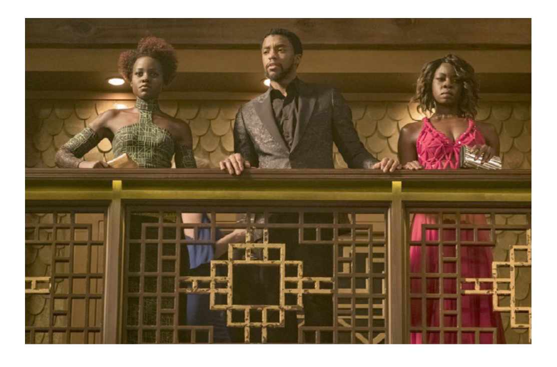
FIGURE Nº 1

Okoye (Danai Gurira) and Nakia (Lupita Nyong'o) with T'Challa (Chadwick Bosman).