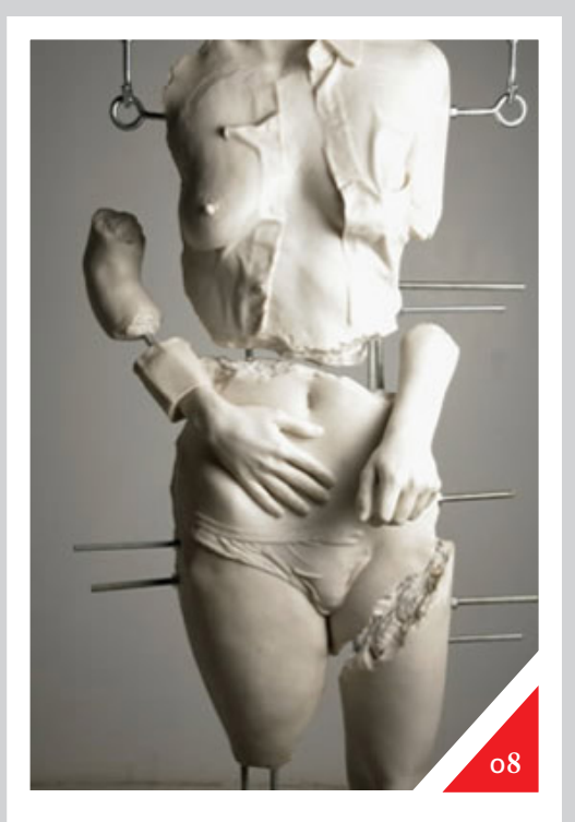
Figure 8: Rossouw van der Walt, Reconstruction of a female monologue on unpredictability, 2007. Cast marble, steel. Life-size 1,7m Courtesy of artist and Visuality/ Commentary Exhibition Catalogue (UP)