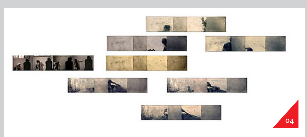
Figure 4: Guy du Toit and Carla Crafford, Visual Dialogue, 2007 Worked bronze, digital photography and mirrors. Eight pieces, each approximately 222 x 1200mm Courtesy of artists and Visuality/Commentary Exhibition Catalogue (UP)