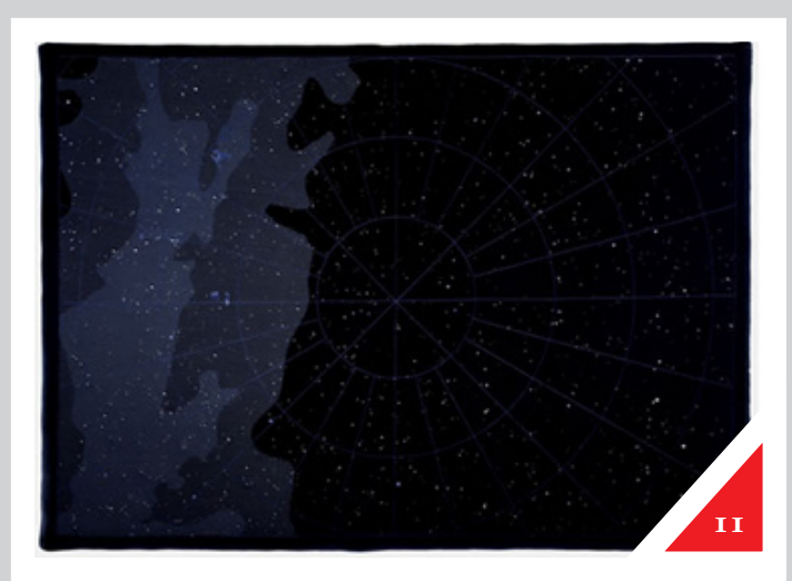
Figure 11: Berco Wilsenach, Astrodeiktikon, 2007. Velvet cushions, pins and staplers. 1470 x 970mm Courtesy of artist and Visuality/Commentary Exhibition Catalogue (UP)