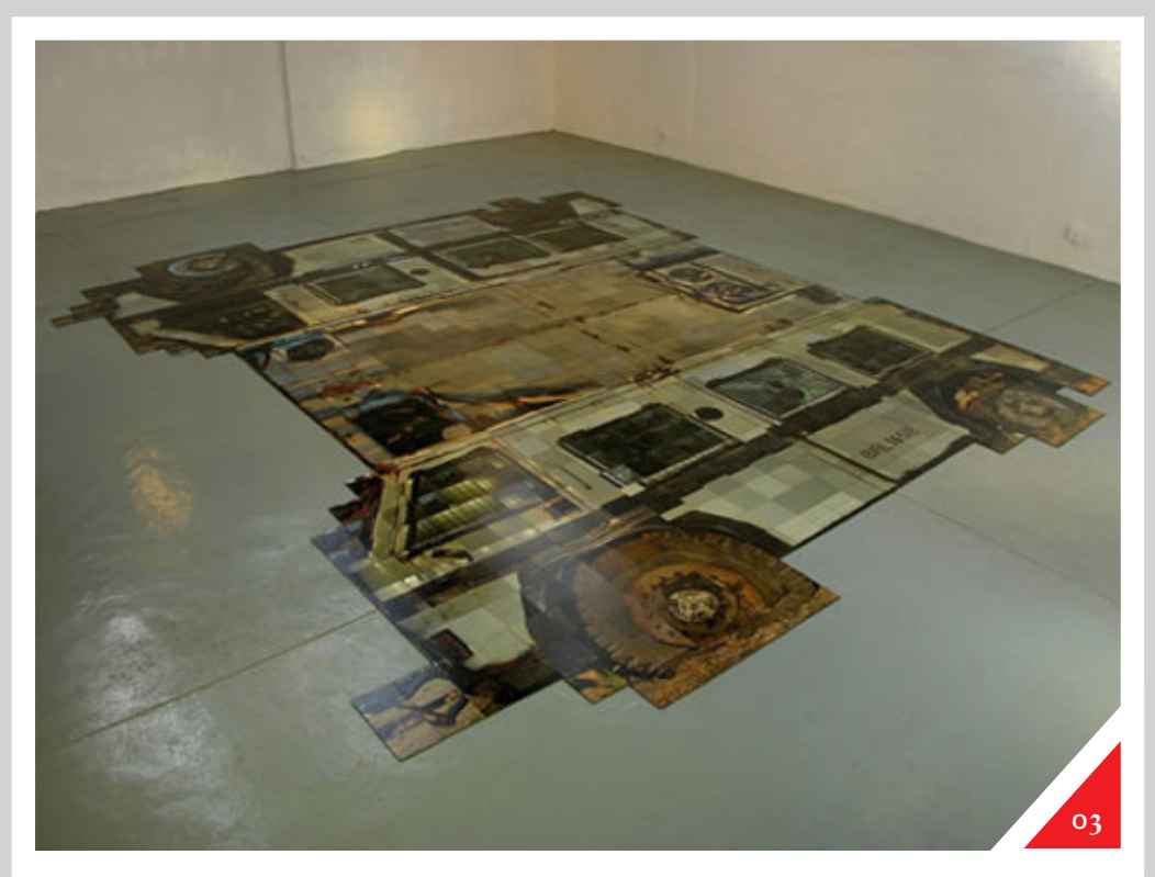
\label{eq:Figure 3: Anton Karstel, 108166N, 2004} Installation, 7 x 6 m \label{eq:Courtesy of artist and Visuality/Commentary Exhibition Catalogue (UP)}