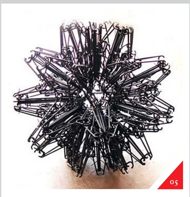
Figure 5: Gordon Froud, Sphere, 2008. Coat hangers, 3m high Courtesy of artist and Visuality/Commentary Exhibition Catalogue (UP)