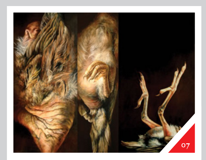
Figure 7: Rina Stutzer, Swarming: fever, flight and yoke, 2006. Oil on canvas, 200 x 140cm Courtesy of artist and Visuality/Commentary Exhibition Catalogue (UP)