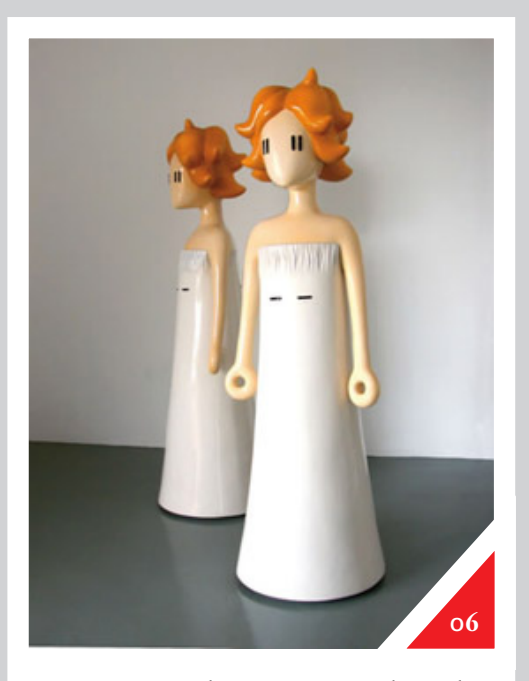
Figure 6: Theresa-Anne Mackintosh, Tina, 2006. Fibreglass. 152 x 55 x 50cm Courtesy of artist and Visuality/ Commentary Exhibition Catalogue (UP)