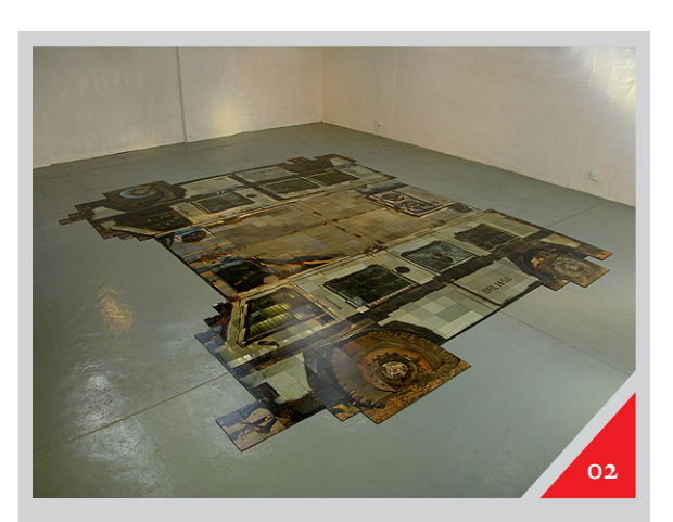
Figure 2: Anton Karstel, 108166N, 2004. Installation, 7 x 6m.

The works of artists such as Anton Karstel, Keith Dietrich and Johan van der Schijff are stylistically and conceptually aligned with global issues of nomadism and mobility, yet their references to South African culture and life are detectable in fragments of colonial histories and local storytelling. Karstel's installation at the Visuality/Commentary exhibition entitled 108166N (2004, Figure 2) consisted of block-mounted photographs and depicts a flat Nyala (a kind of antelope) police truck. A photographic record of the surface of the armoured truck was made by the artist and presented laid out on the floor like a vast piece of skin, reminiscent at the same time of flattened