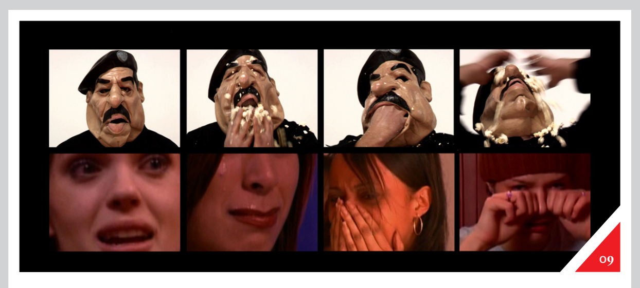
Figure 9: Johan Thom, Birth of a tyrant, 2007. Looped two channel video projection, 3 min 27 sec. Installation, 7 x 6m.