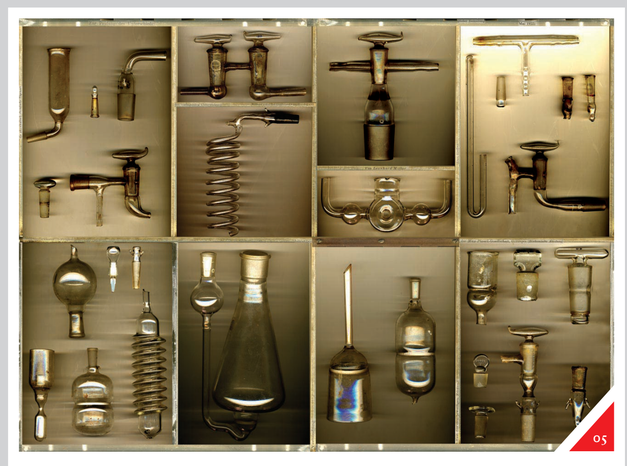
Figure 5: Gwenneth Miller, Holy relics (no date). Ultra chrome inks on Hahnemühle paper, A1.