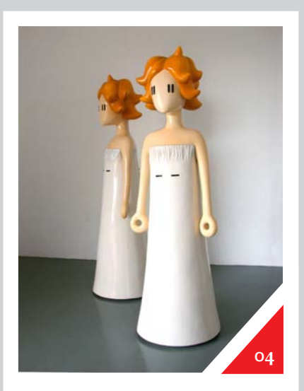
Figure 4. Theresa-Ann Mackintosh's, Tina , 2006. Fibreglass, 152 x 55cm.