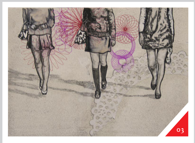
Figure 3: Adele Oldfield, Detail of Wo-man , 2008. Mixed media, 100 panels, each panel 15 x 21cm.