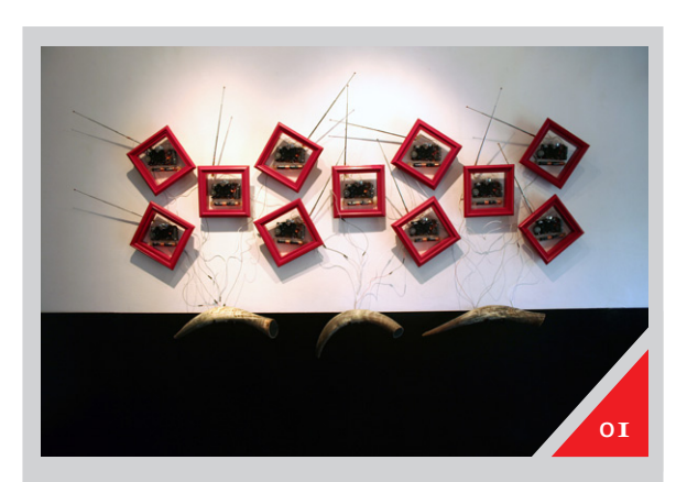
Figure 1: Talita Swarts, Kwere-kwere (no date). Radio installation, 2 x 2m.

knowledge and information through communication technologies. Yet every radio is tuned to a different station, confirming human individuality and differences.