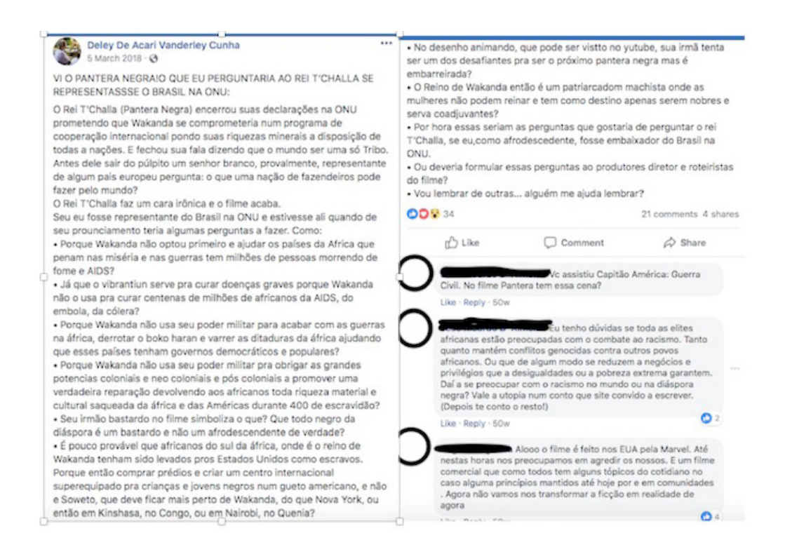
FIGURE Nº 2

Facebook Comments - Authorised for credited use by Deley Wanderley Cunha