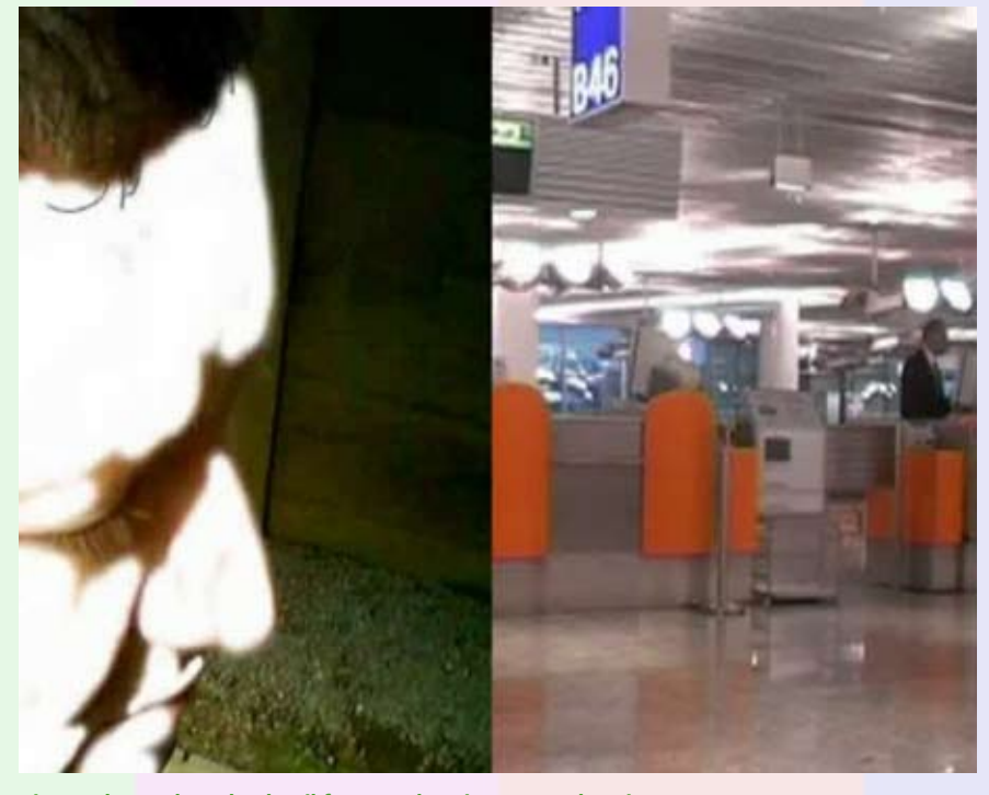
Figure 4a: M Edwards, detail from Authentic – not authentic