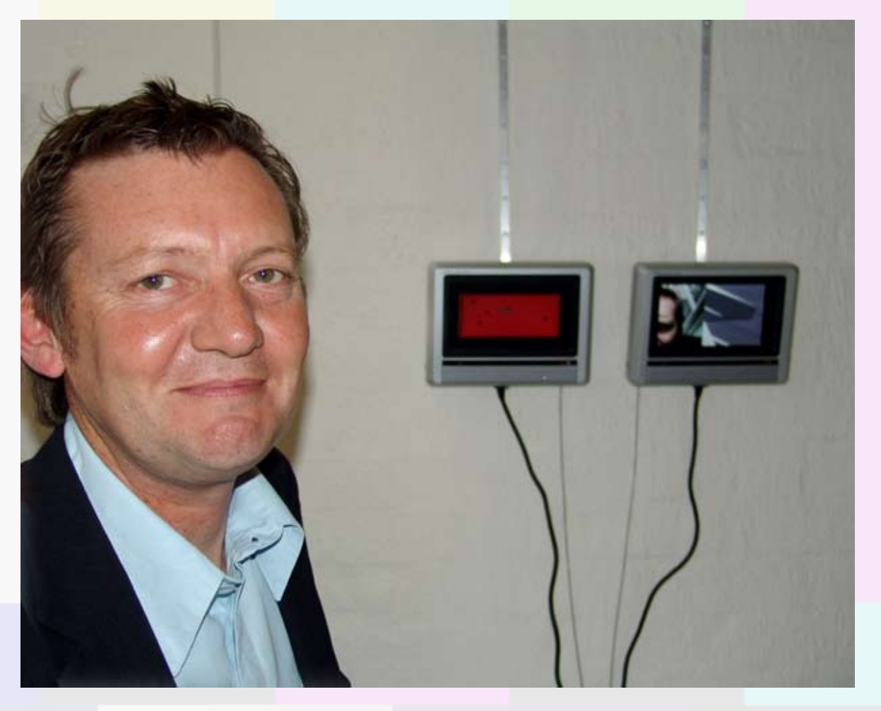
Figure 2: M Edwards, Authentic – not authentic, self practice from 11/04/05 to 12/05/06

Zaayman (2005:159) cites Mark Postner's notion of digital media within the public sphere as 'a space' rather than 'a tool', and suggests that 'this new mental space constitutes a virtual geography of sorts, and like any space, the topogra-