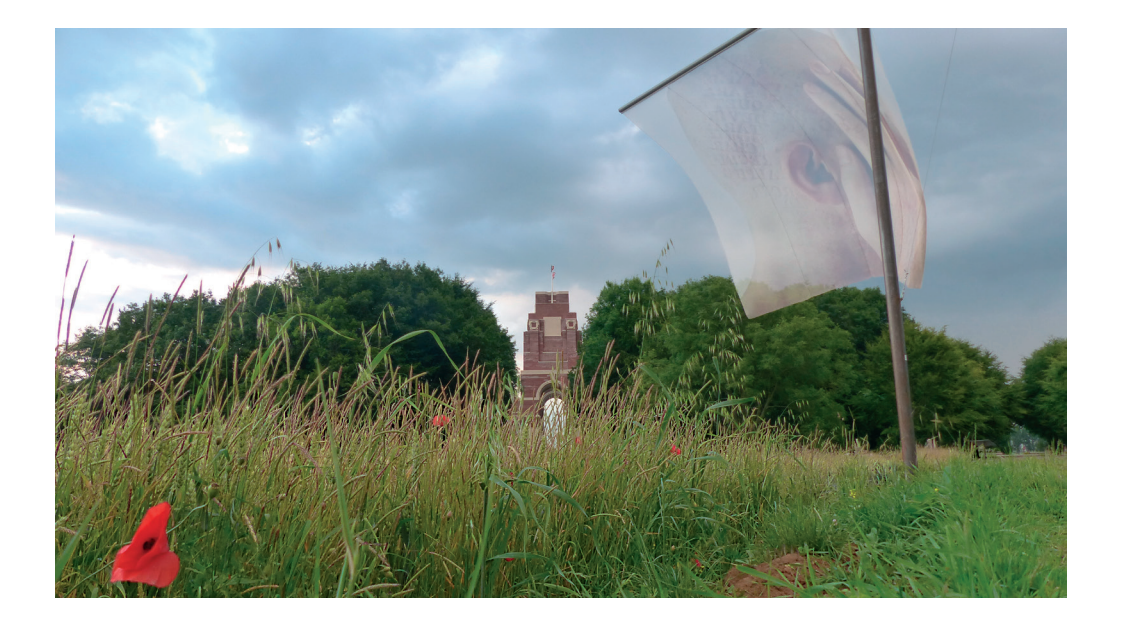
FIGURE N^0 8