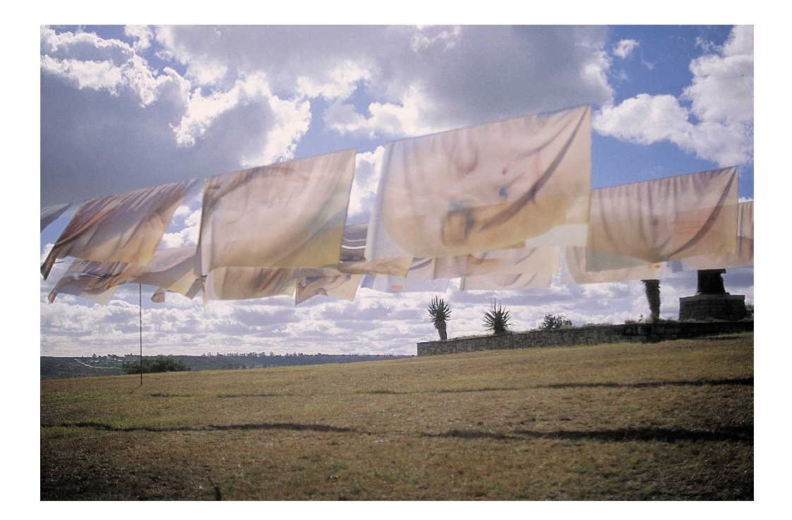
FIGURE Nº 1