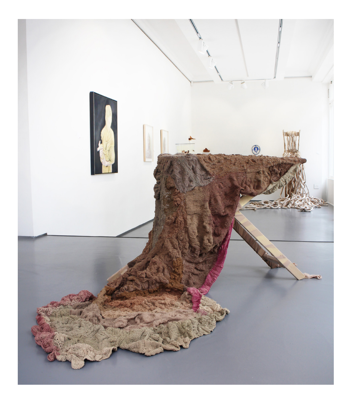
FIGURE Nº 4

The Deep End (2017). Mixed Media, 70 x 140 x 105 cm. Cape Town: Artist's Collection.