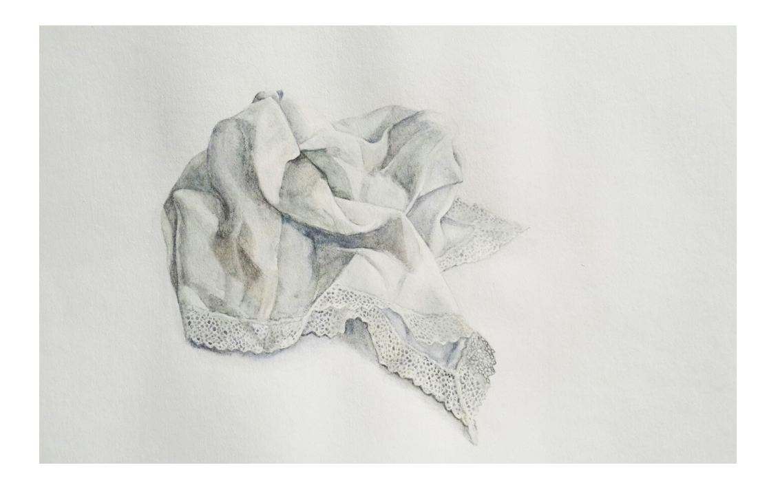
FIGURE Nº 9

Little White Lies [installation view, detail] (2011). Handkerchiefs, hair and glue. Dimensions variable. Gallery North, Newcastle-upon-Tyne, UK, 07-23 September 2011.