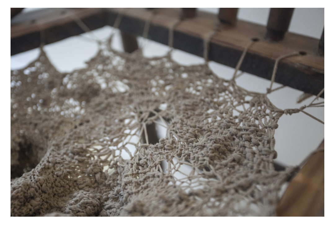
FIGURE Nº 3

Detail of Slippery Slope (2013). Found chair and knitted stockings. 105 x 78 x 100 cm. Cape Town: Artist's Collection.