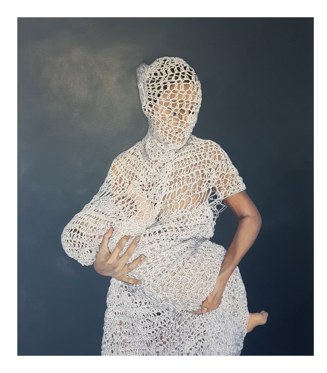
FIGURE N^0 7

Entangled Particles (2018). Oil on canvas, 130 x 115 cm. Cape Town: Private Collection.