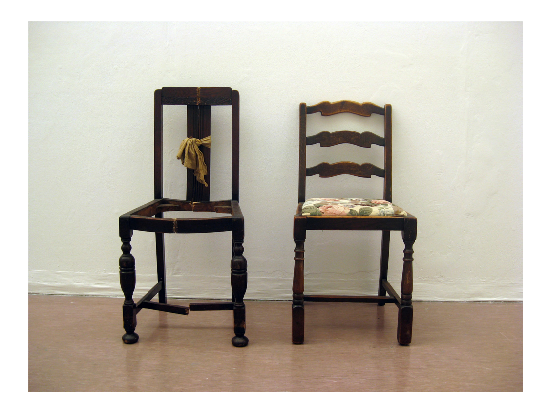
FIGURE Nº 2

Moonshine and Roses (2011). Chairs, hair and stocking. 38,5 x 42 x 89 cm / 38 x 42 x 83 cm. Worcester: Private Collection. Cape Town: Artist's Collection.