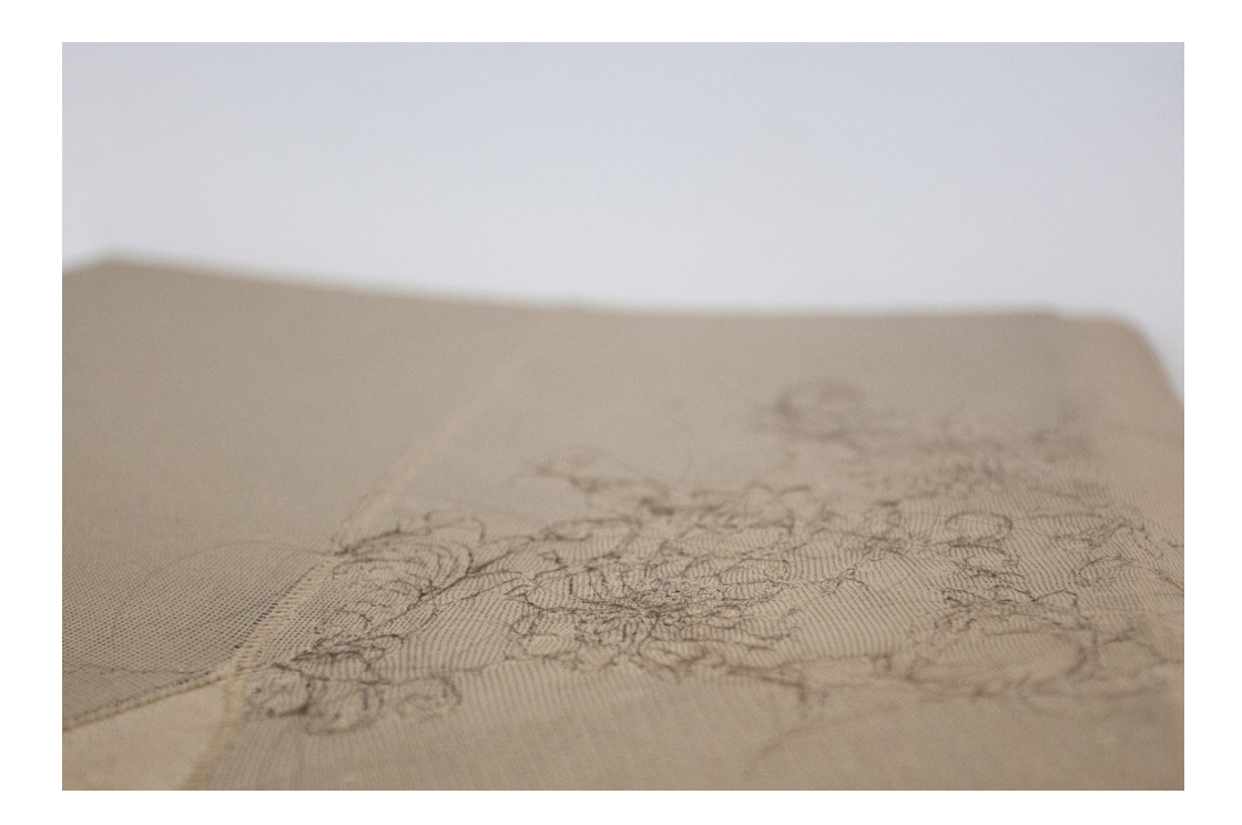
FIGURE Nº 11

Nothing without you (2011). Found chair seat, hair and stocking. 33 \times 36 \times 20 cm. Cape Town: Artist's Collection.