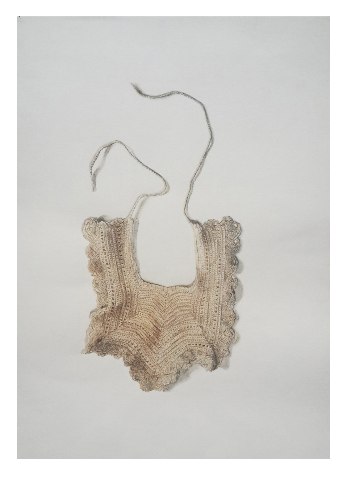
FIGURE N^0 5