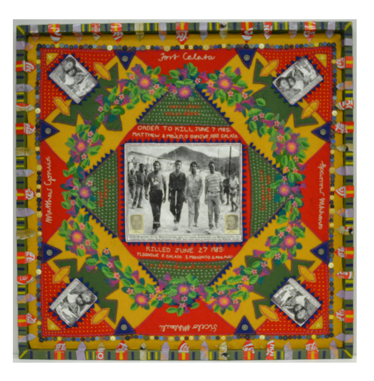
FIGURE N^0 5