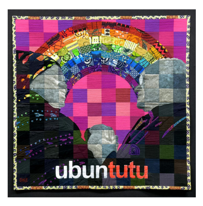
FIGURE Nº 9

Quilts made in South Africa now reside in private and public collections around the world; quilts made in the United States now reside in museum collections in South Africa. These textiles and the accompanying stories of who made them, when and why they were made and how they were used, and who now owns them and how their stories are interpreted and carried forward, be it by scholars, family members, curators, or digital indices, are important. They contribute to our understanding of multi-layered, intertwined histories of people and places.