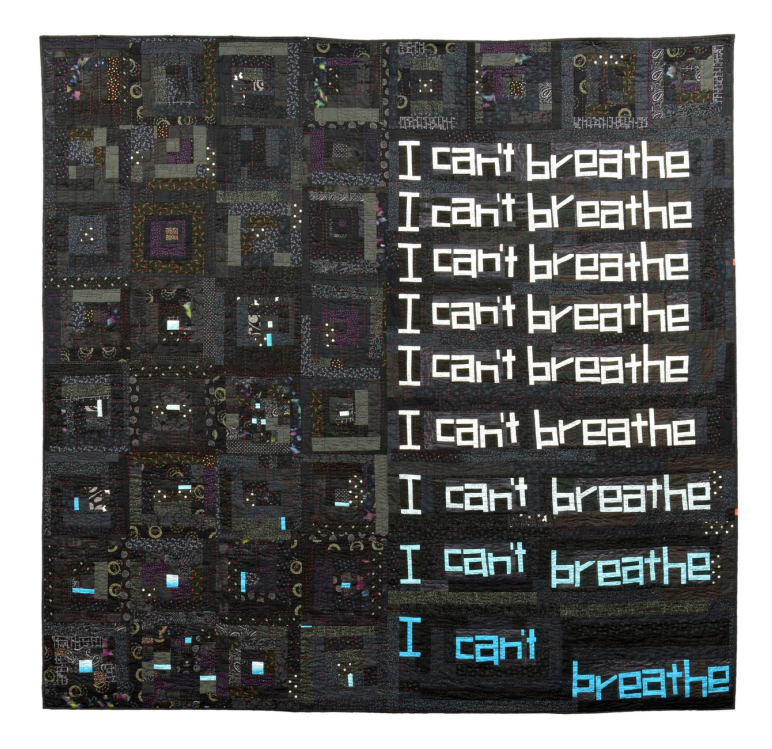
FIGURE Nº 6

Cradock Four from For the Fallen series made by Sandra Kriel 1991-92. Collection of the Mayibuye Centre, University of Western Cape.