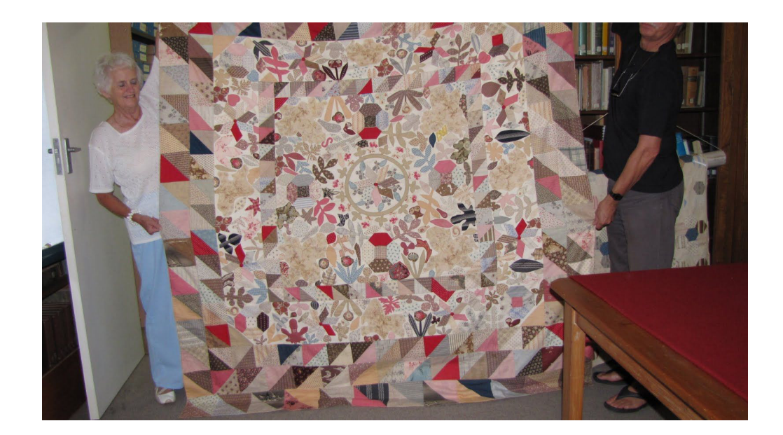
figure Nº la

Little is also known about the origins of an appliquéd and embroidered bedcover acquired by the Michigan State University Museum, East Lansing, Michigan, USA in 2016 (Figure 2). The Etsy online seller provided this information, '[h]ere is a great item from a recent estate. This beautiful hand-made piece is a memorial of The Second Boer War (Oct. 1899 - May 1902), between Great Britain and South Africa. Good condition for its age. "Worked on in 1900 by M. Bimsom". This appears to be unstitched. 2/17/2016' (Michigan State University Museum 2016). From a strictly material culture object analysis basis, we know that, in addition to the inscribed reference to the maker, the textile also carries the embroidered slogan 'United We Stand for Queen and Empire' as well as embroidered names of individuals or groups whose portraits adorn the quilt. Military historian Michael