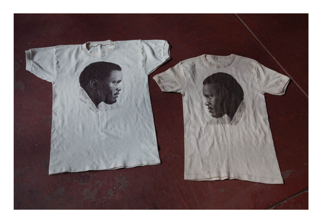
FIGURE No 1

Biko's funeral would be the first occasion that his portrait would be multiply reproduced on clothing. From the late 1970s, T-shirts with a martyr's portrait introduced a new genre of visual culture to appear at funerals of anti-apartheid activists (Hill 2015:35). The T-shirts were mass produced on cheap garments and the often-rudimentary designs included the deceased's portrait, name and sometimes political slogans or an organisation's logo. While the Biko T-shirt contains no text, it was probably the first such memorial T-shirt (Figure 1).