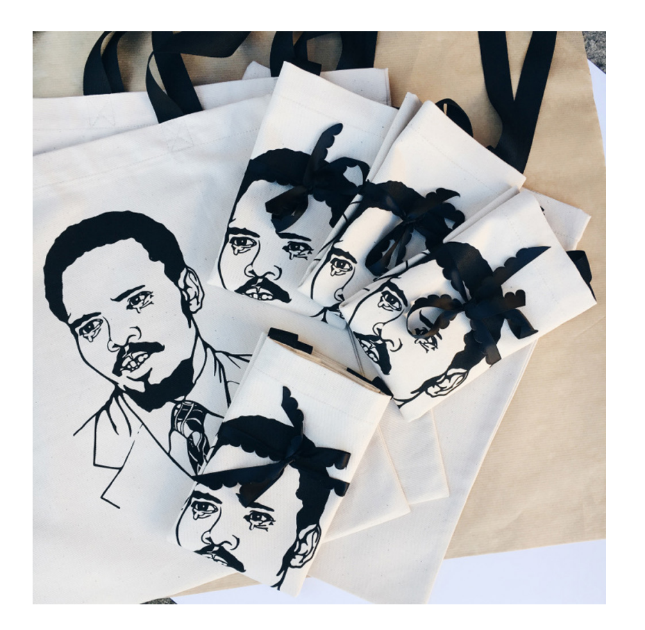
FIGURE N^{o} 5

Pigments Studio. 2016. Biko tote bag (obverse side, detail). Design and photograph by Pigments Studio, creative direction by Siki Msuseni and design execution by Xolani Dani. Printed canvas bag. Photograph reproduced with permission of Siki Msuseni (Pigments SA 2016).