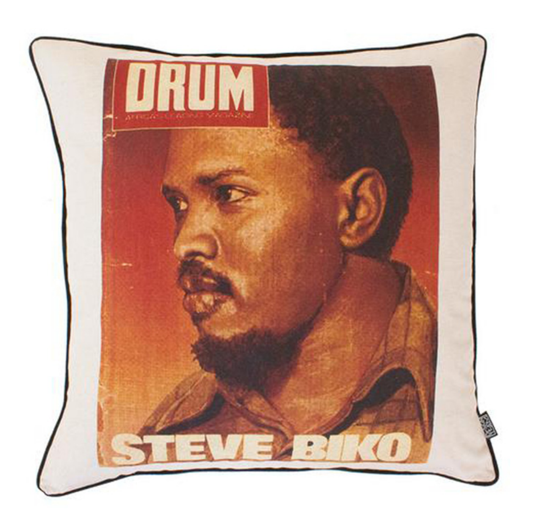
FIGURE No 3

Design Team. [Sa]. Biko scatter cushion, Novelty collection (discontinued). Screen printed linen, 60x60cm. (Material life 2017).