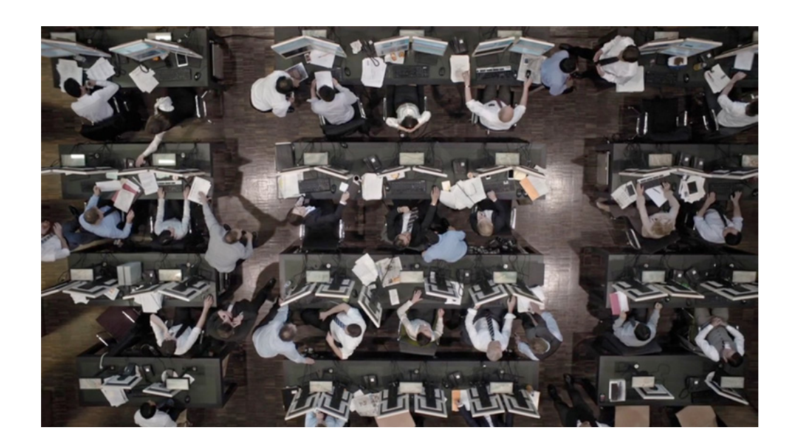
FIGURE No 4

One trader among many © Rosefeld 2015 (fair use copyright permission).