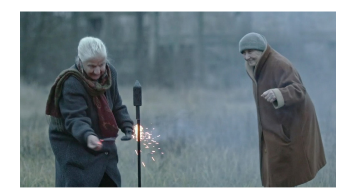
figure No 3

Lighting the fuse © Rosefeld 2015 (fair use copyright permission).