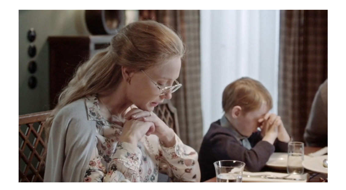
figure N^0 8