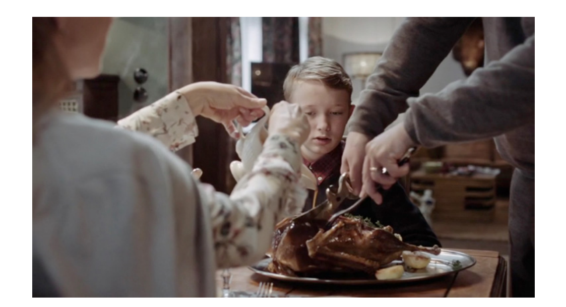
FIGURE Nº 9