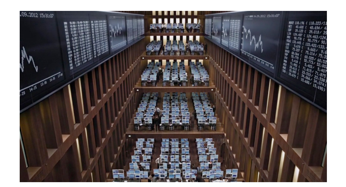
FIGURE N^{o} 5