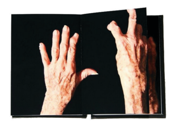
FIGURE No 6

David Paton. Speaking Digitally (detail) from Speaking in Tongues. 2015, artist's book.