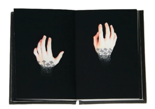
FIGURE No 5

David Paton. Speaking Digitally (detail) from Speaking in Tongues. 2015, artist's book.