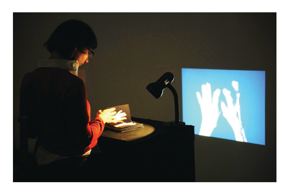
FIGURE Nº 4

David Paton. Speaking Digitally (detail) from Speaking in Tongues. 2015, artist's book.