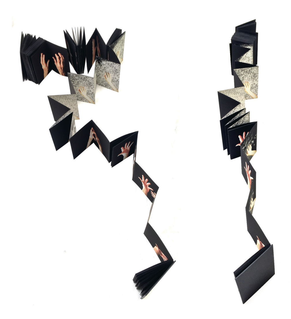
FIGURE N^{o} 12

Leporello foldout using part of the section of pages seen in Figure 10c above but also including a different section of Digitally Speaking from Speaking in Tongues . 2015. This flexibility of openings radically expands the given narrative, producing seemingly endless permutations of the storyline.