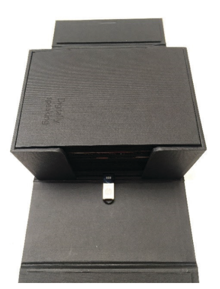
FIGURE Nº 13

View of the flash drive embedded within the box base of Speaking in Tongues. 2015, artist's book.