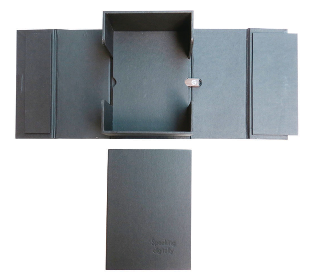
FIGURE Nº 1

the book, but helps organise the two chapters of the book as a conceptually continuous cycle without a defined front or back. This special edition now facilitates starting from either end, with all the page-turning and opening possibilities contained in the initial book. Each book in the edition is housed in a black fabric-covered gatefold box with magnetic strips for closing and the title and artist's name blind embossed onto the lower right hand cover section by hand letterpress in Gill. A re-edited 8:24 minute video is found on a tiny flash drive embedded in the base of the box. The video is meant to be projected at the same intimate dimensions of the book - 153mm (h) x 210mm (w), when opened. The reader is encouraged to view the video whilst reading the book so as to reflect upon differences in tempo and duration in each of the two narratives.2