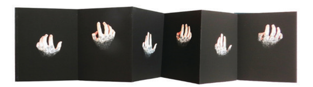
FIGURE N^{o} 2

David Paton. Speaking Digitally (detail) from Speaking in Tongues. 2015, artist's book.