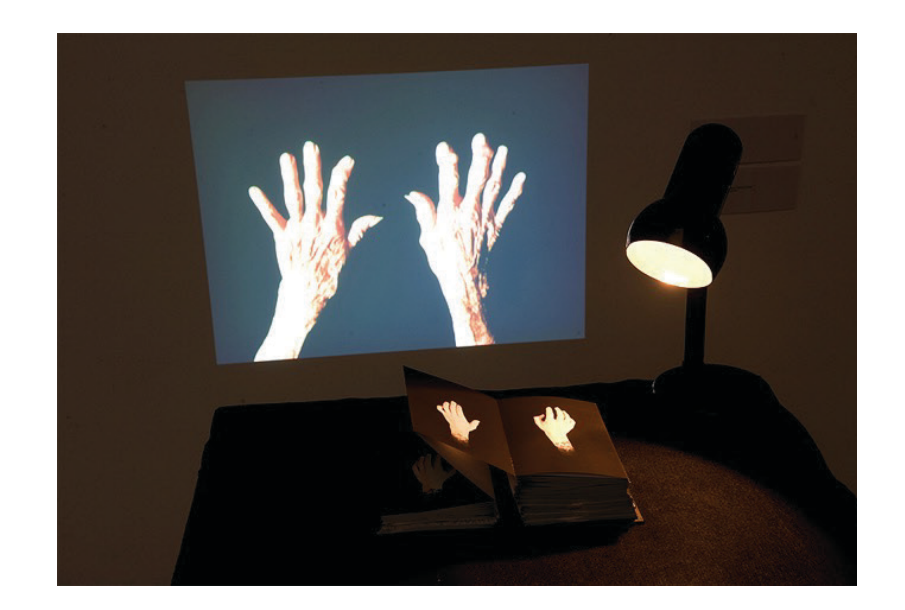
FIGURE N^0 14