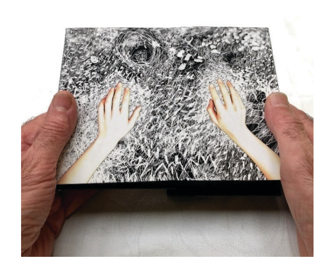
FIGURE N^0 8

Haptic symmetrical handling of pages of Speaking Digitally (detail) from Speaking in Tongues. 2015, artist's book.