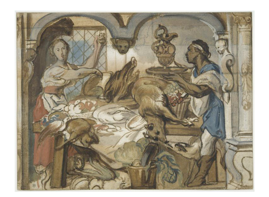
figure Nº 1

Jacob Jordaens, View of a Kitchen and a Table Laden with Food (ca. 1635). Drawing, 21.5 x 28.8 cm. Paris, Ecole Nationale Supérieure des Beaux-Arts.