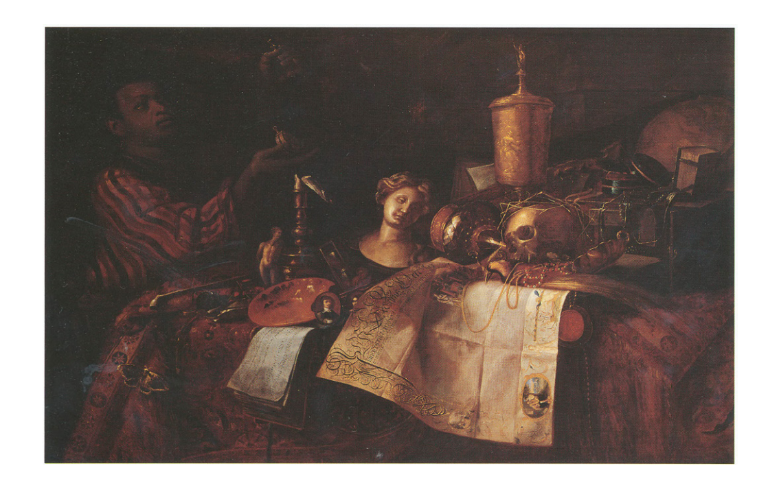
FIGURE Nº 4

Cornelis Norbertus Gijsbrechts, Vanitas Still Life with a Black Page Presenting a Pocket Watch . Signed and dated upper right: CORNELIVS NORBERTVS GYSBRECHTS/ ANNO 1657 . Oil on canvas, 115 x 163 cm. Galerie Pardo, Paris; auction Ader, Paris, 09/04/1990, lot 61; present location unknown.