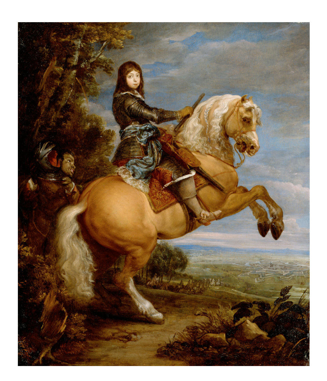
FIGURE No 9

Gonzales Coques, Equestrian Portrait of Henry Stuart , Duke of Gloucester (ca. 1656-57). Oil on copper, 44.7 x 38.3 cm. Herzog Anton Ulrich-Museum, Braunschweig, inv. 856.