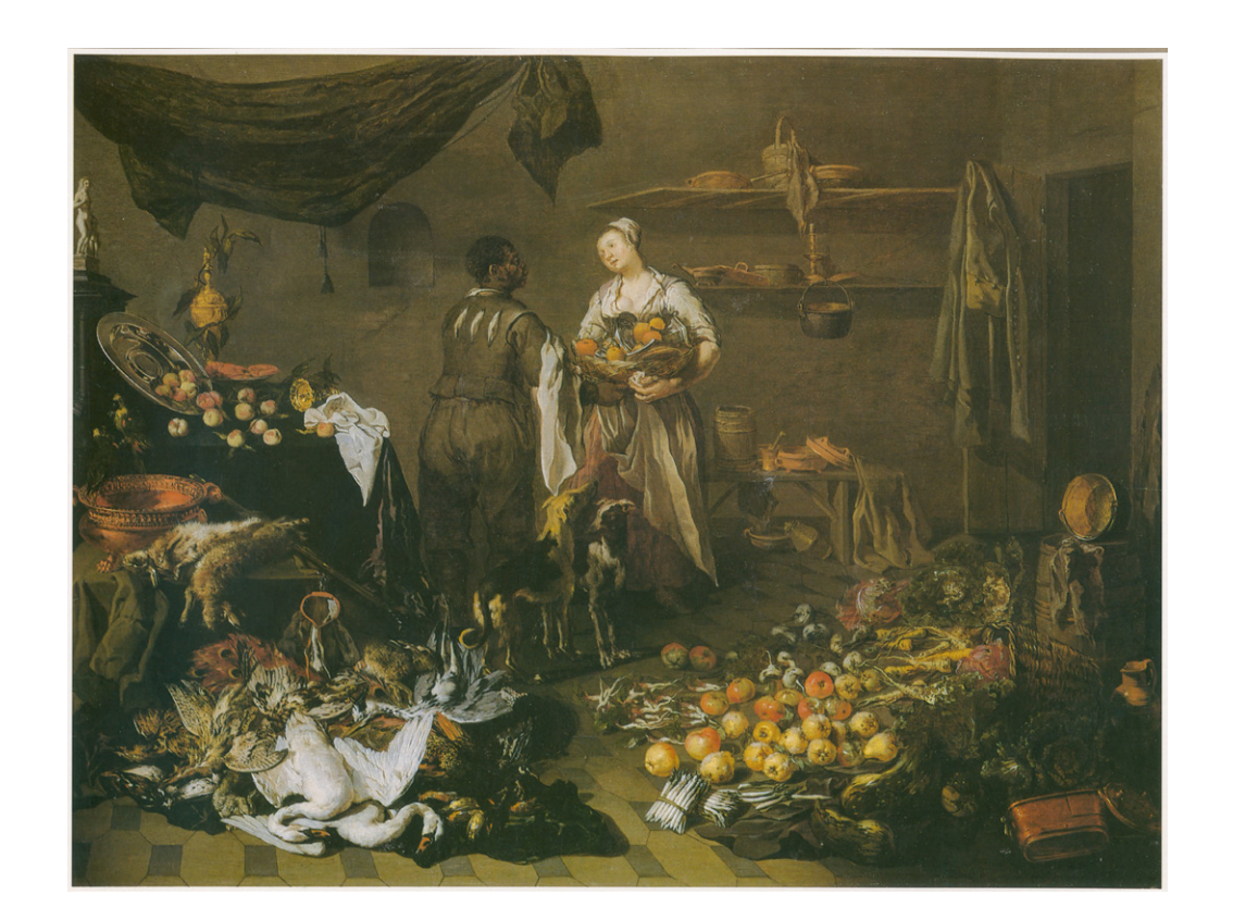
FIGURE Nº 11

Jan van Kessel the '"other'", Kitchen Interior with Black Servant and Kitchen Maid. Signed and dated lower right: J.v.kesseL / 1650. Oil on panel, 69.5 x 92 cm. Robert Noortman Gallery, Maastricht, London (1986).