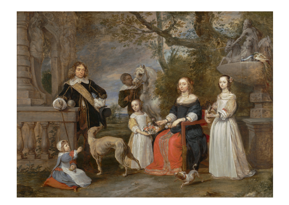
figure No 10

Gonzales Coques, Family Portrait in a Landscape (ca. 1657). Oil on panel, 58.4 x 81.3 cm. The Nelson-Atkins Museum of Art, Kansas City, Missouri. Purchase: William Rockhill Nelson Trust, 32-18.