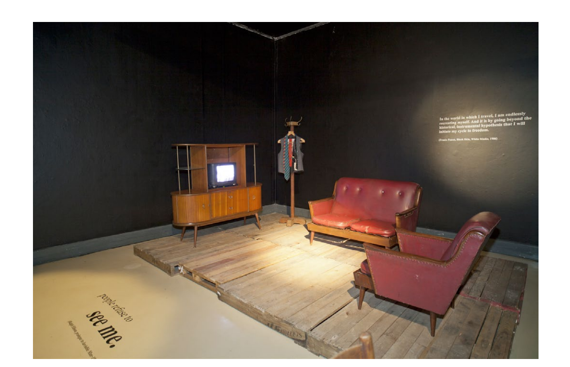
FIGURE No 4