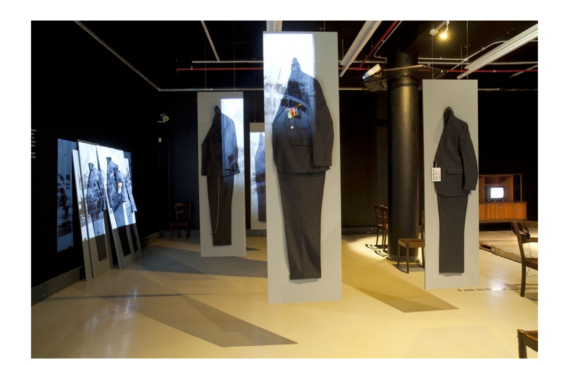
FIGURE No 3