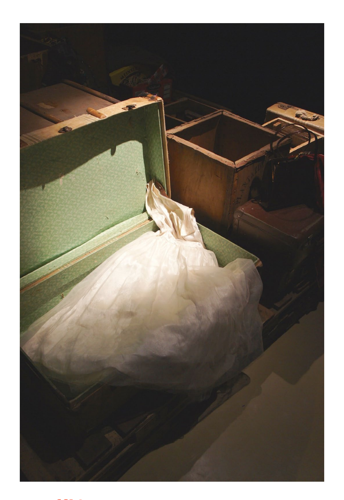
FIGURE Nº 2

Christine Checinska, The Arrivants , 2016. Detail of installation.