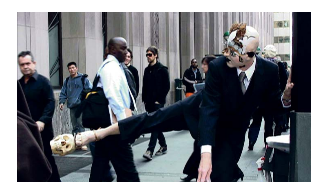
FIGURE No 4

Steven Cohen, Golgotha (still). 2007-2009. Single channel HD film. 20 minutes 8 seconds. Copyright Steven Cohen, courtesy of Stevenson, Cape Town and Johannesburg.