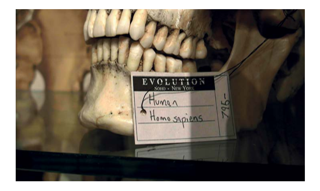
FIGURE Nº 10

Steven Cohen, Golgotha (still). 2007-2009. Single channel HD film. 20 minutes 8 seconds.