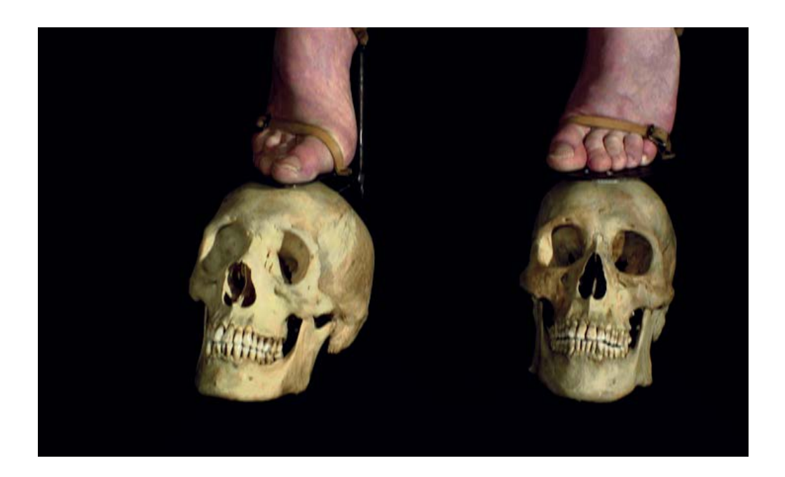
FIGURE No 2

Steven Cohen, Golgotha (still). 2007-2009. Single channel HD film. 20 minutes 8 seconds. Copyright Steven Cohen, courtesy of Stevenson, Cape Town and Johannesburg.