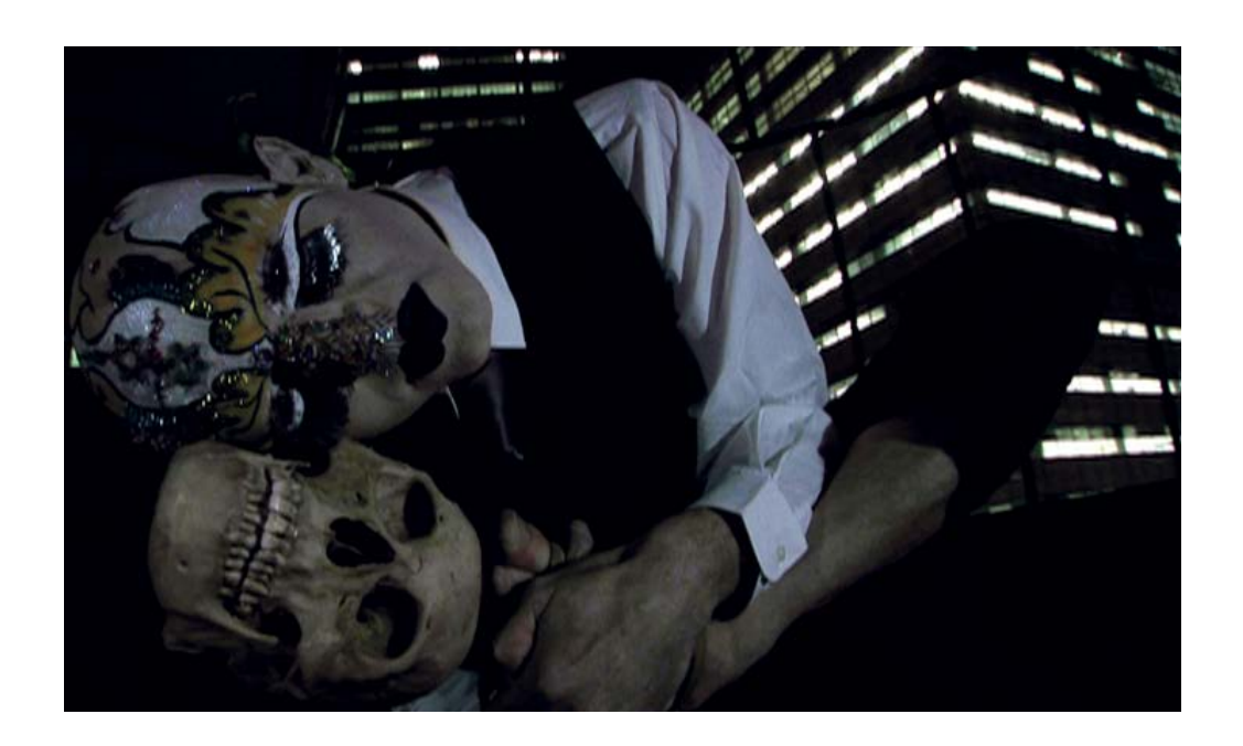
FIGURE Nº 8

Steven Cohen, Golgotha (still). 2007-2009. Single channel HD film. 20 minutes 8 seconds.