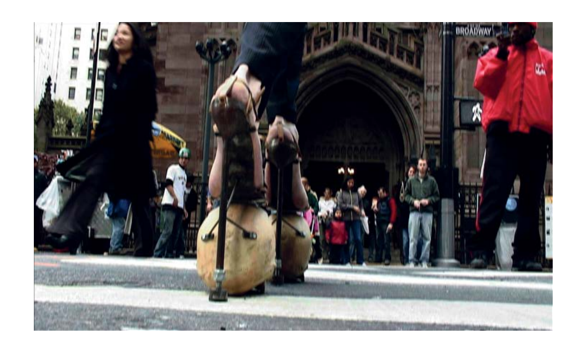
FIGURE No 5

Steven Cohen, Golgotha (still). 2007-2009. Single channel HD film. 20 minutes 8 seconds. Copyright Steven Cohen, courtesy of Stevenson, Cape Town and Johannesburg.