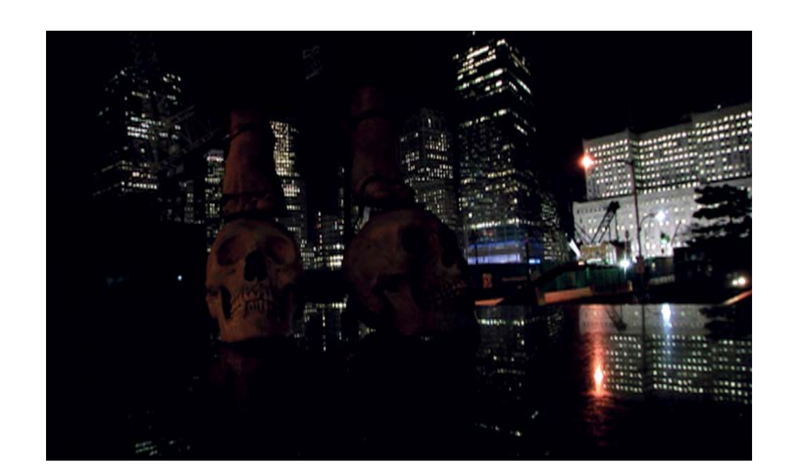
FIGURE No 7

Steven Cohen, Golgotha (still). 2007-2009. Single channel HD film. 20 minutes 8 seconds. Copyright Steven Cohen, courtesy of Stevenson, Cape Town and Johannesburg.