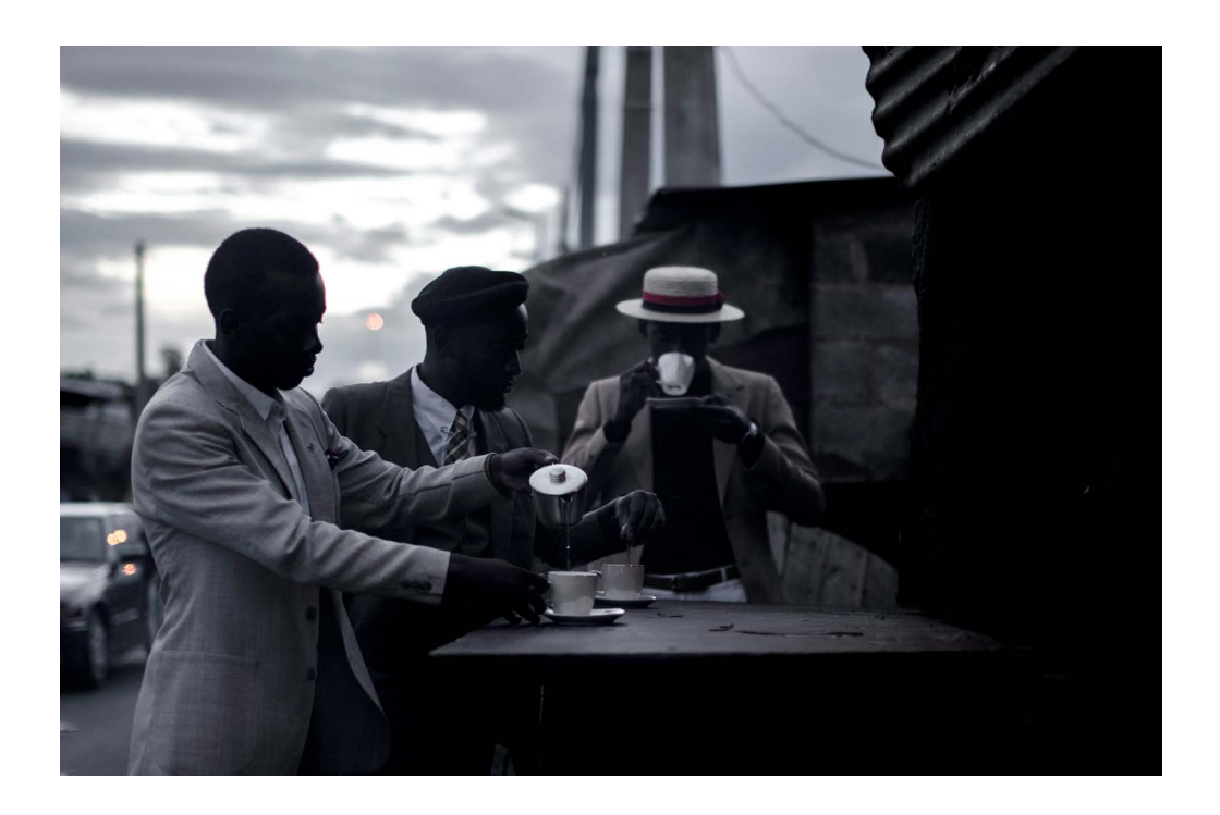
FIGURE No 3

Khumbula, The three stages of preparing tea, 2014. Digital print