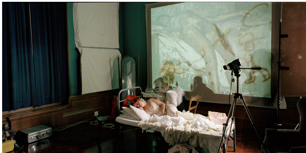
FIGURE N° 3