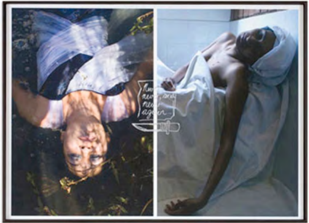
FIGURE N° 4