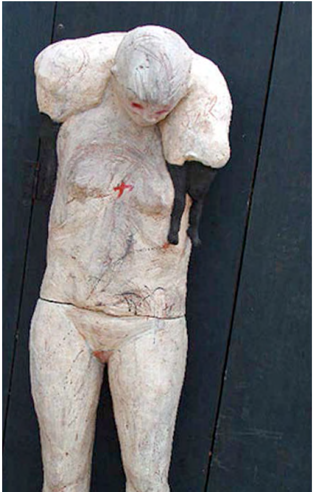
FIGURE Nº 1