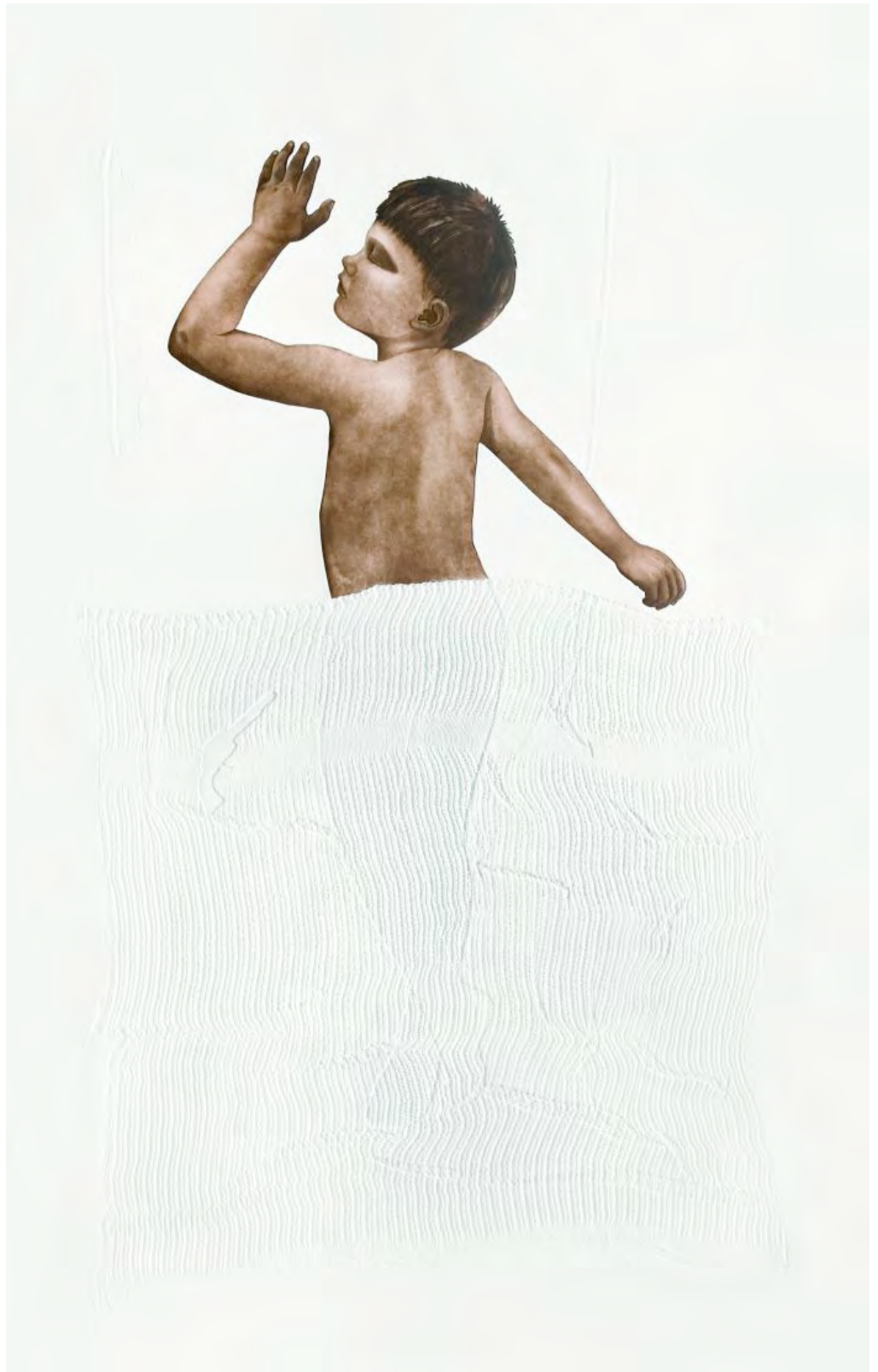
FIGURE N° 6