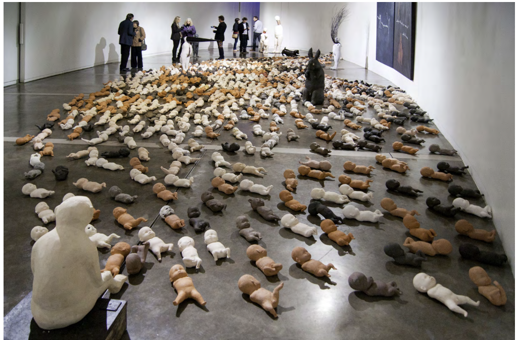
FIGURE N° 7